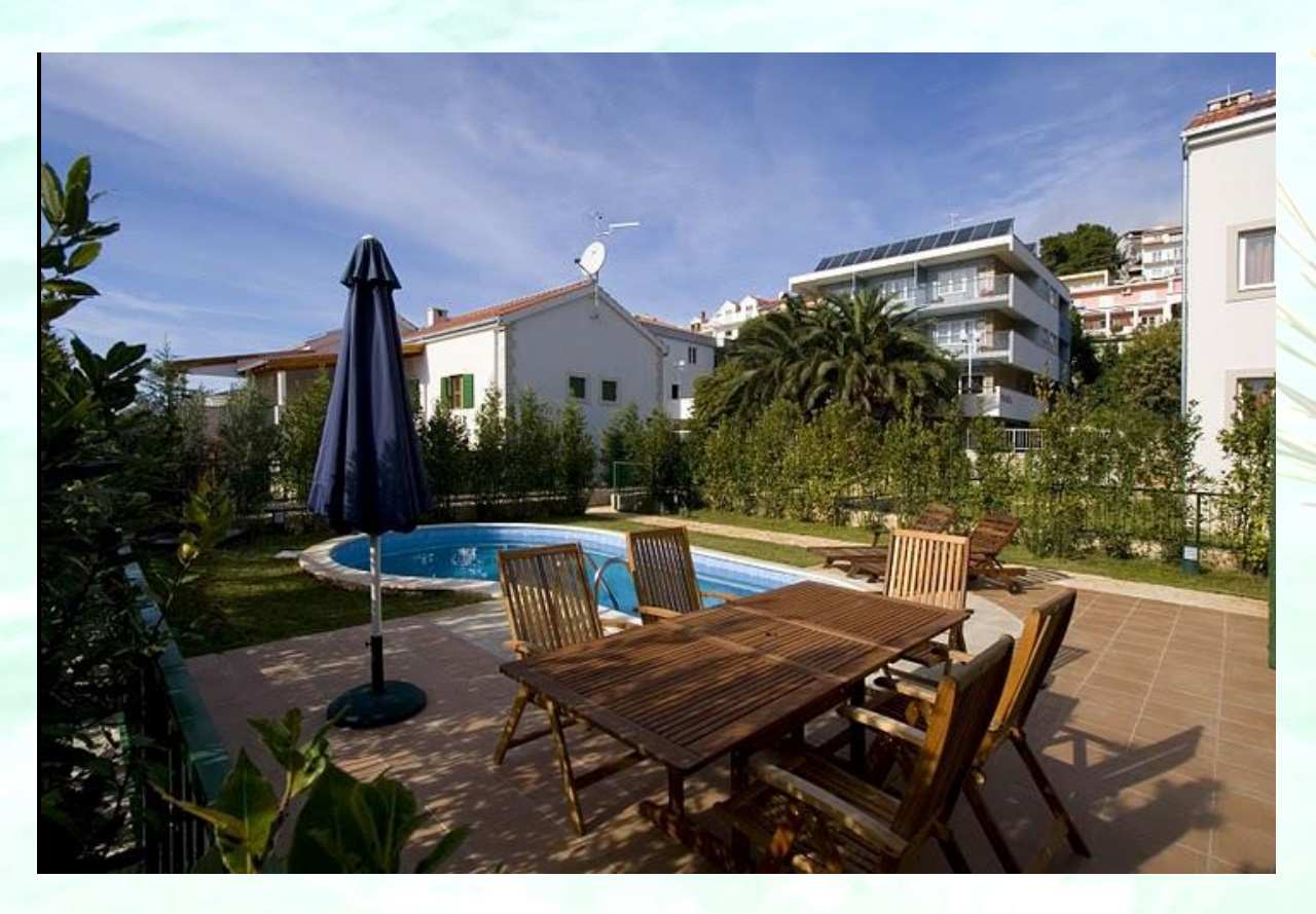
Picture 7: Enjoy your breakfast at sunrise on the terrace by the pool