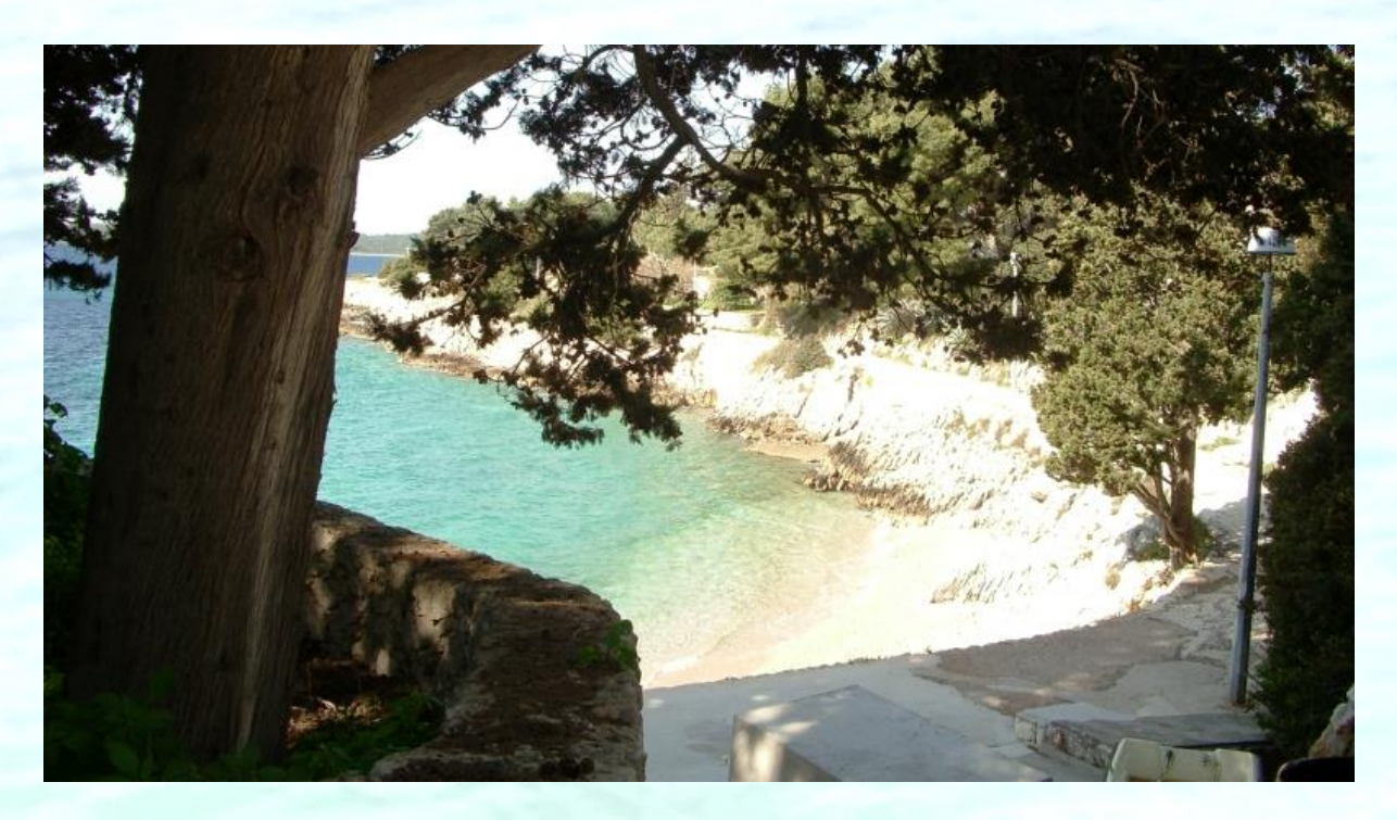
Picture 6: A path to the pebble beach with small white stones leads to the beach (80 m)