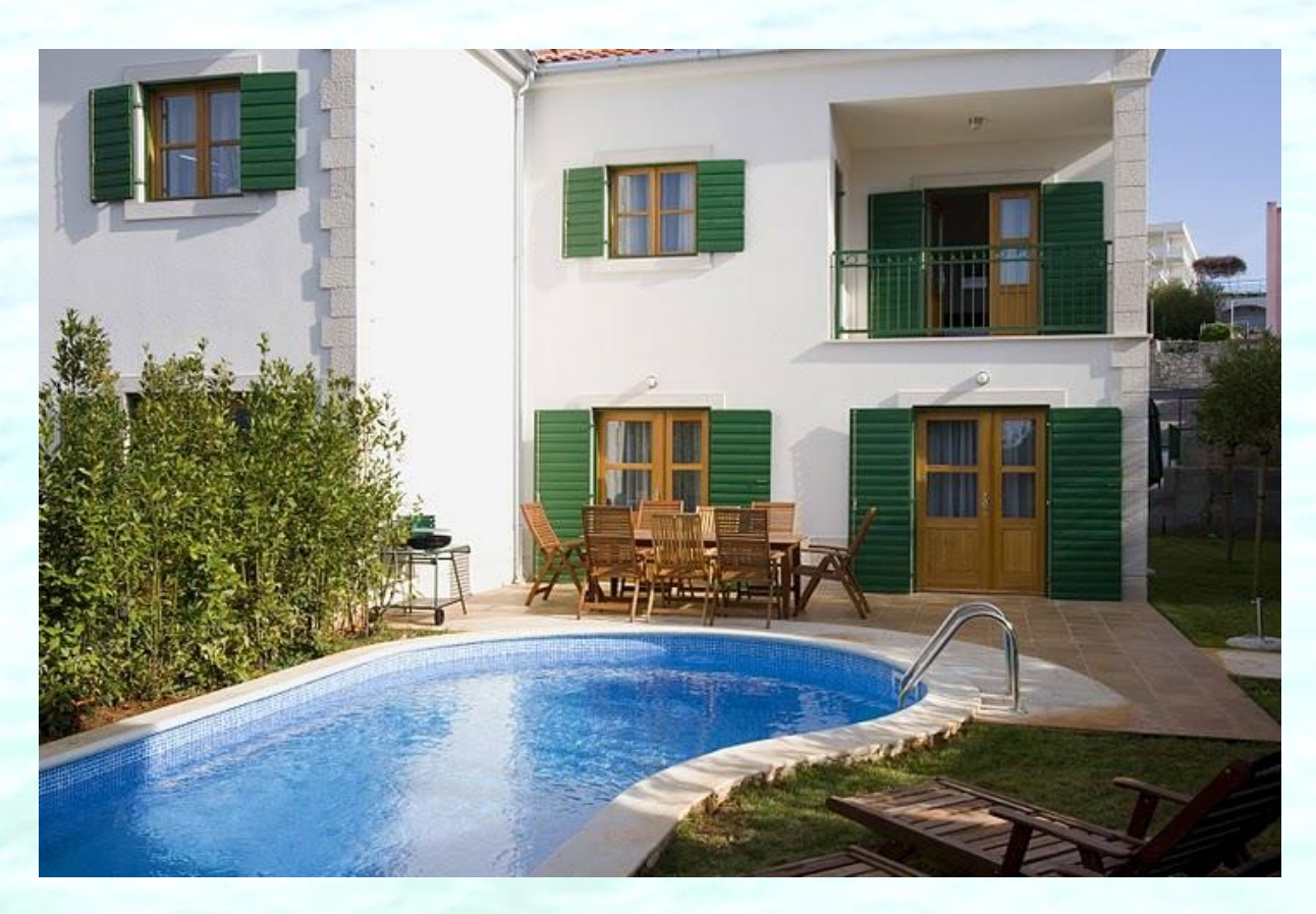
Picture 2: Villa Lady of the Sea nr. 4 with pool and an outdoor mobile grill