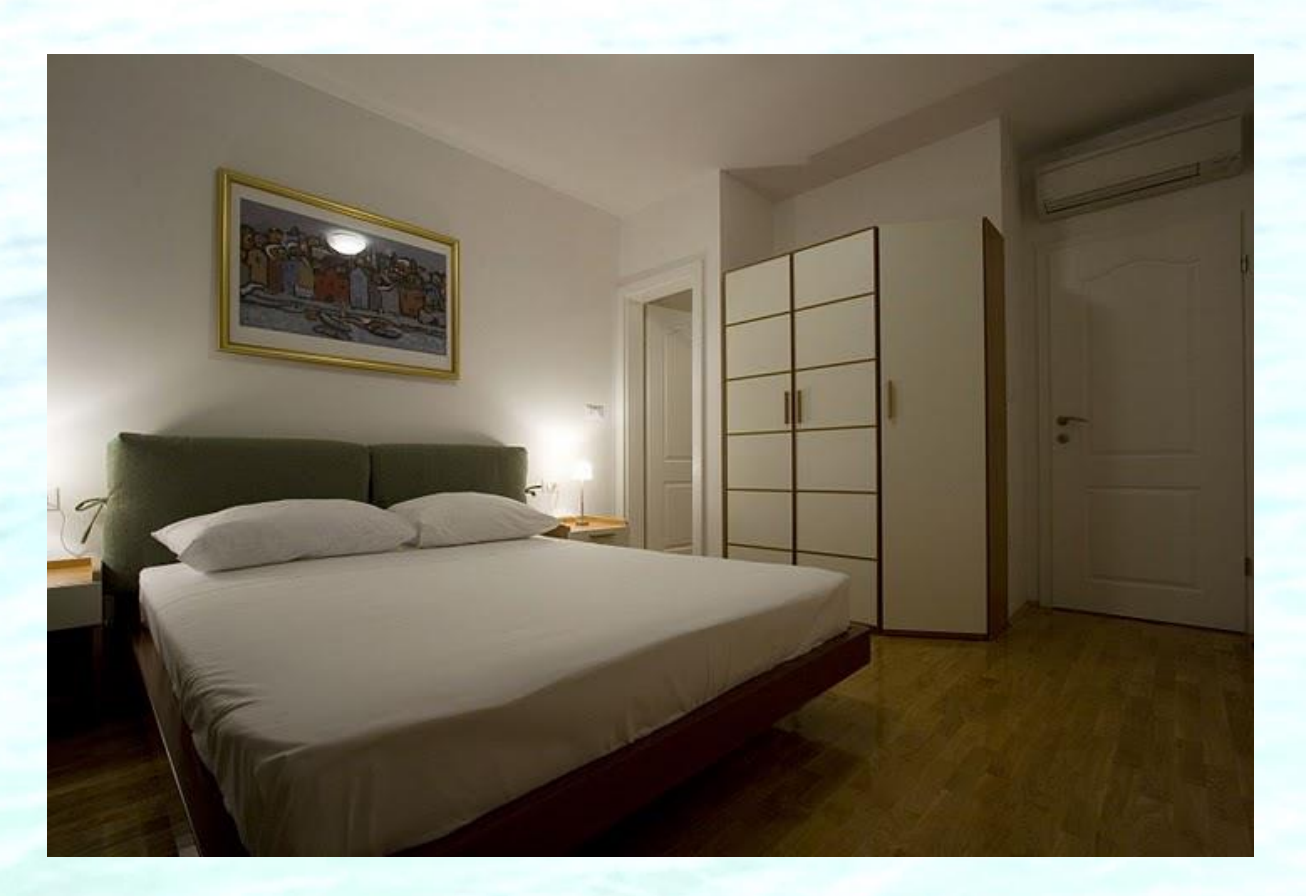
Picture8 : 2 out of 4 bedrooms have a double bed