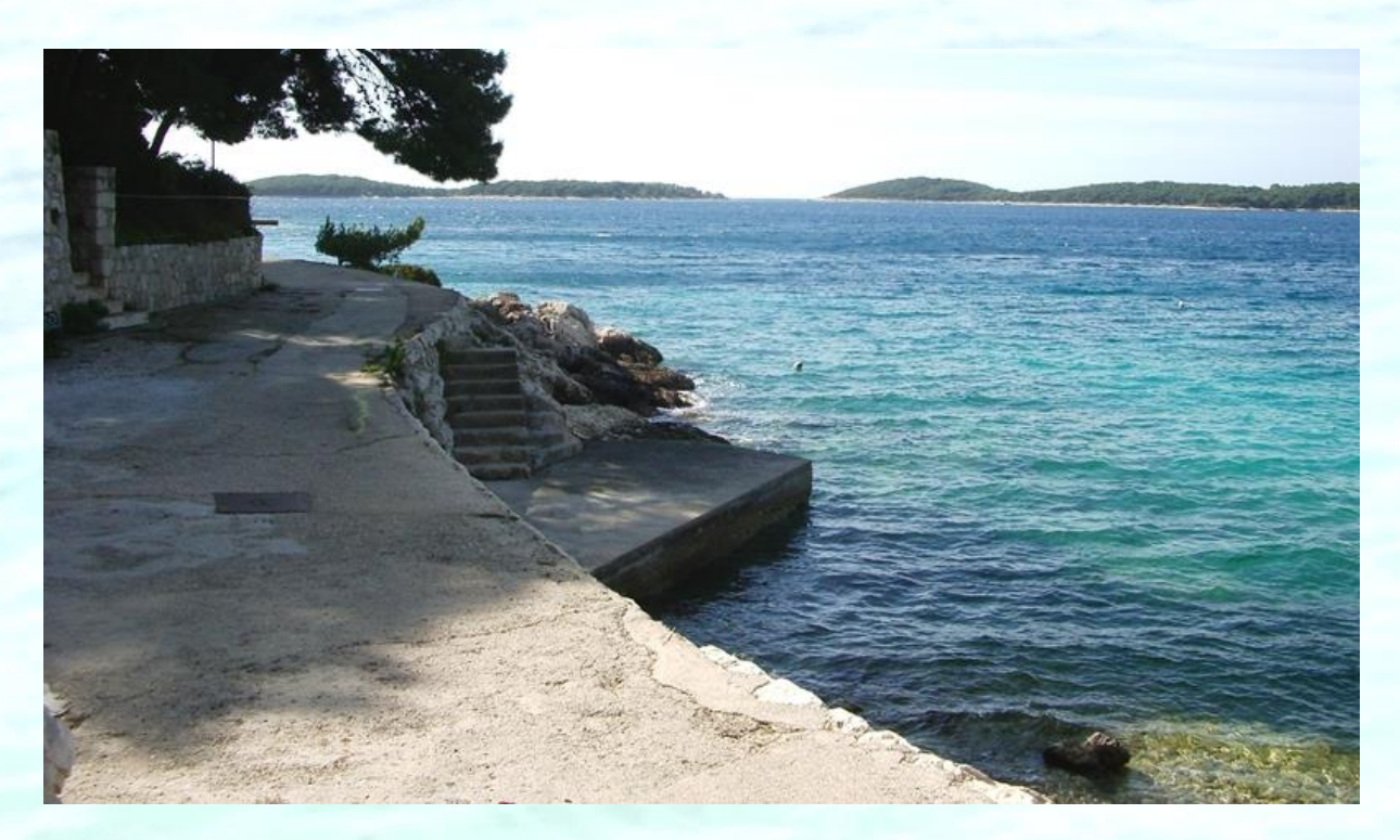
Picture 4: A pebble and concrete beach is only 80 m away from the villa Lady of the Sea