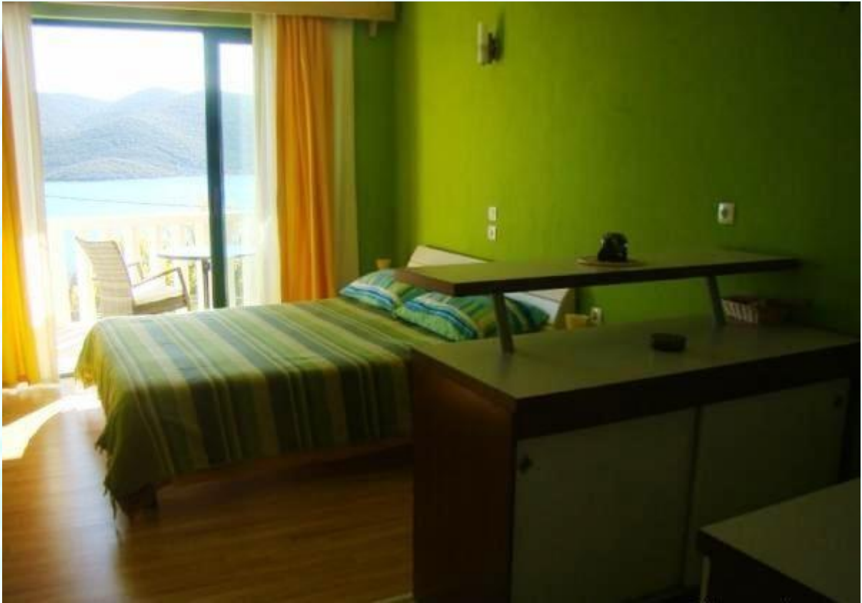
Gree studio apartment (27m 2 ) with a comfortable double bed