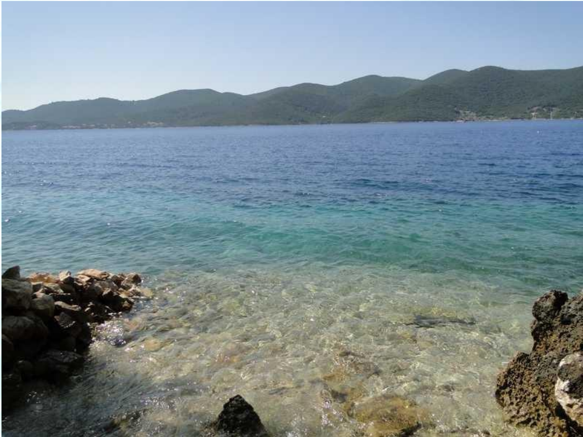
Entrance to the sea at the private beach