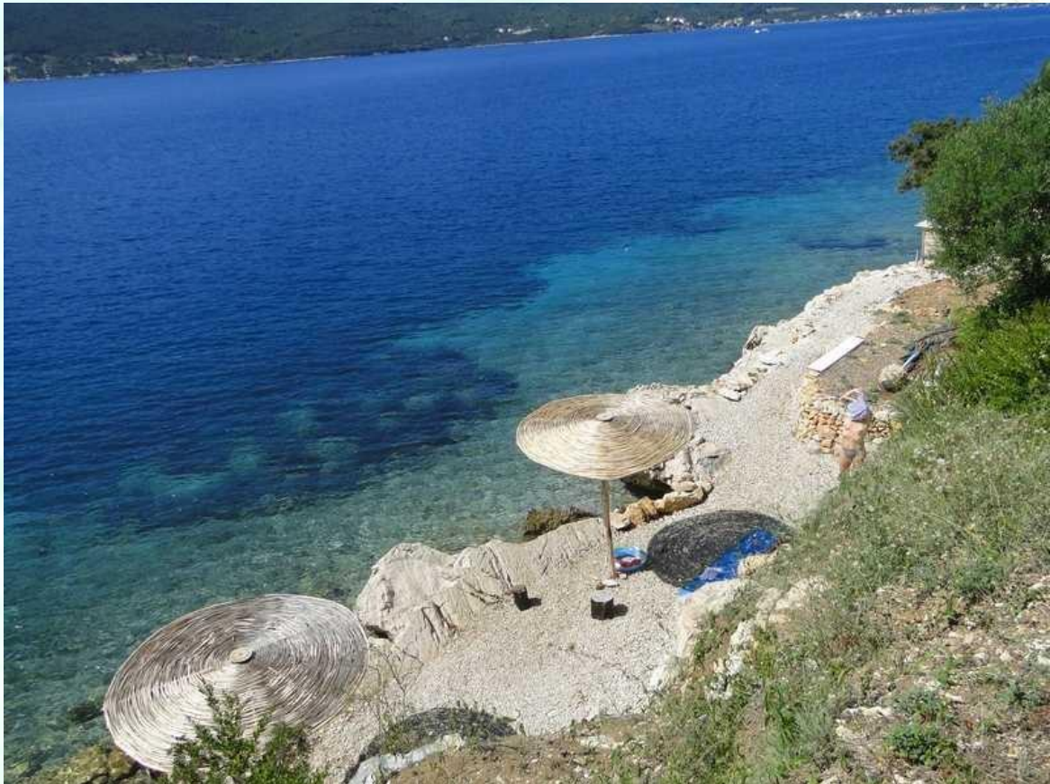
A view of the private beach with sun shades