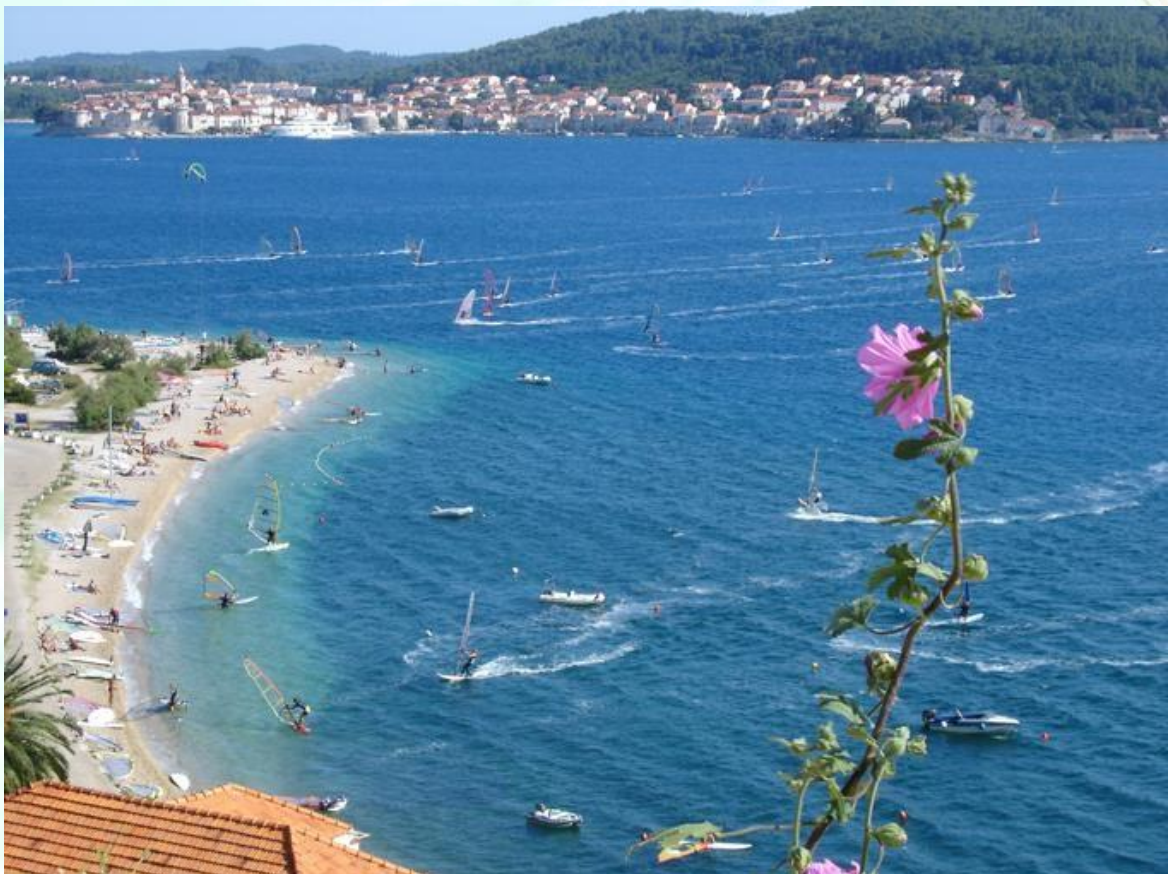
The famous Punta beach – you can get there by bikes (only 10 min) or by car (only 5 min)