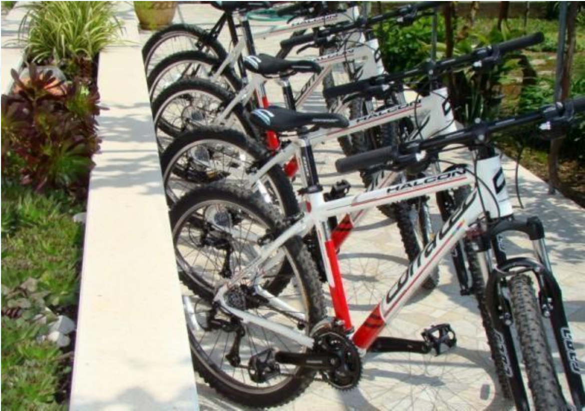
Free bike rental courtesy of the apartments to go to the beach