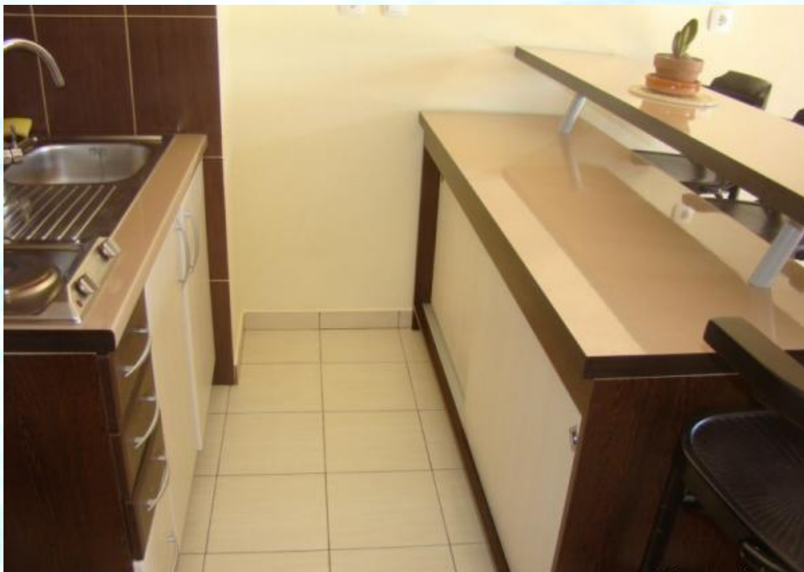
Kitchenette of the green apartment

Kiting and surfing school near the apartments – adventure guaranteed!