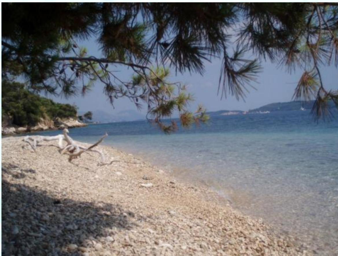
Pebble beach near the apartments Hedonist