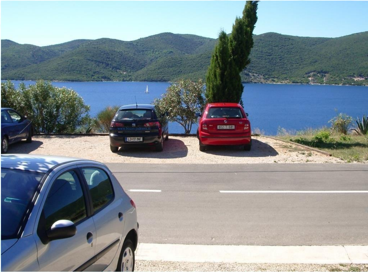
Private parking area of the apartments with the private beach under it