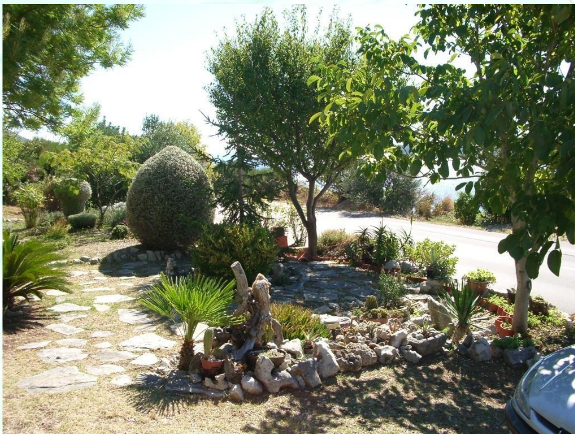
Mediterranean garden in front of the apartments with an aromatic scent