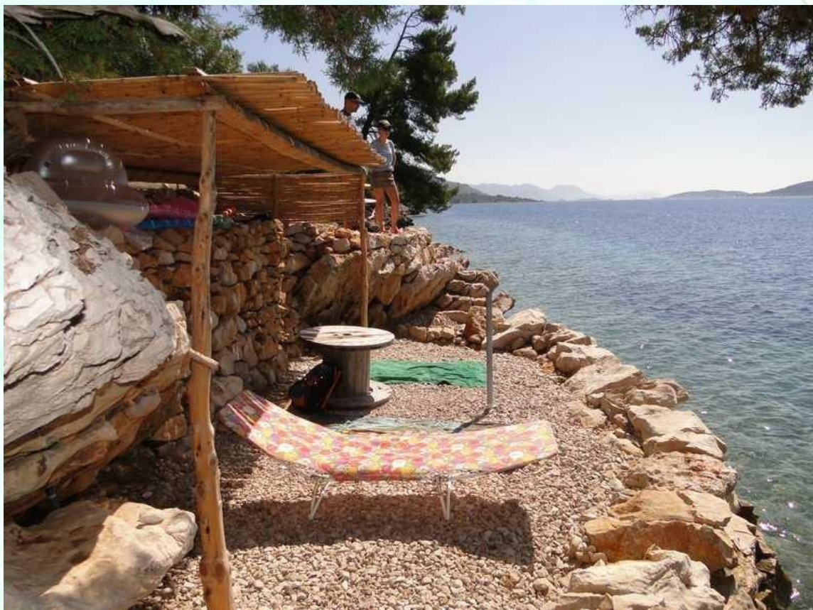
The private beach built by the owner and his family