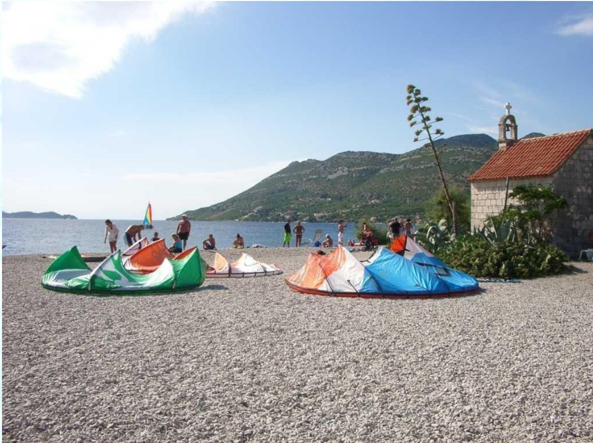
The beach that attracts many kites and surfers from around the globe