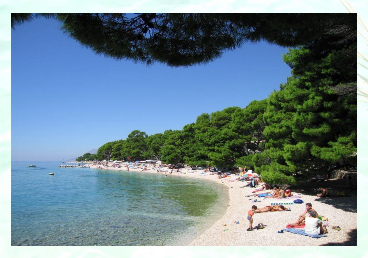
The beach in Brela was named Adriatic's most beautiful beach in 2005, (Lonely Planet)