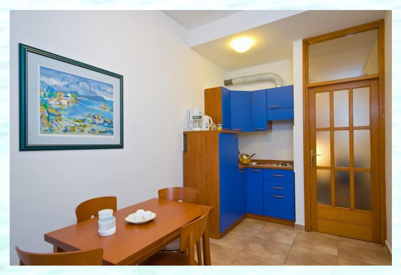
From the dining area there is the entrance to the bedroom with 2 separate beds