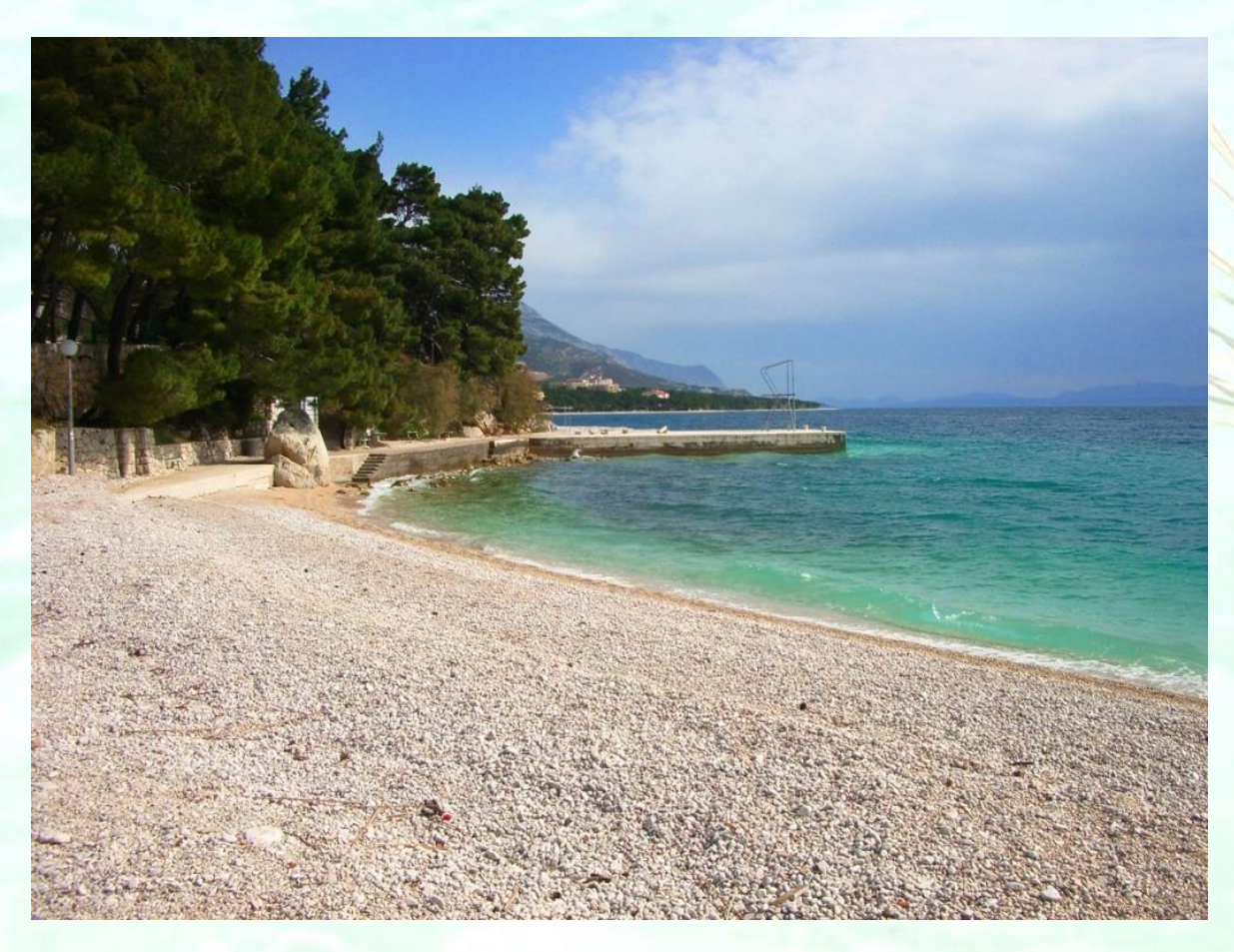
The beach under the apartments – you can reach it by the path (140 m) or stairs