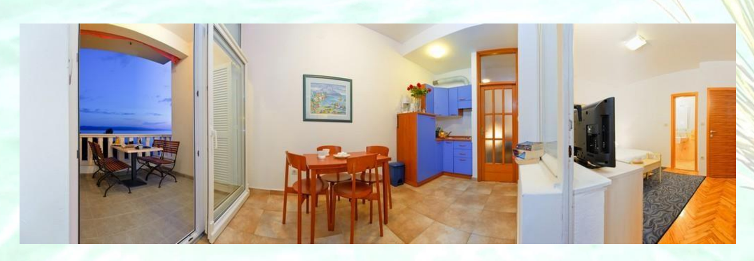
The kitchenette with dining room is on the left, the door next to it enter the bedroom with 2 beds, on the right of the photo is the bedroom with double bed and bathroom