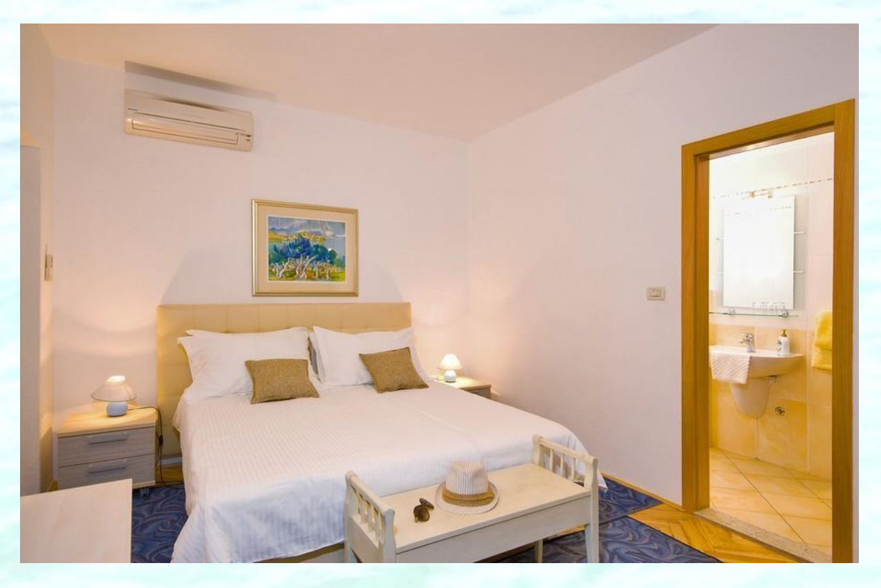
Bedroom with the double bed, the entrance to the apartment is on the right side near the bathroom.