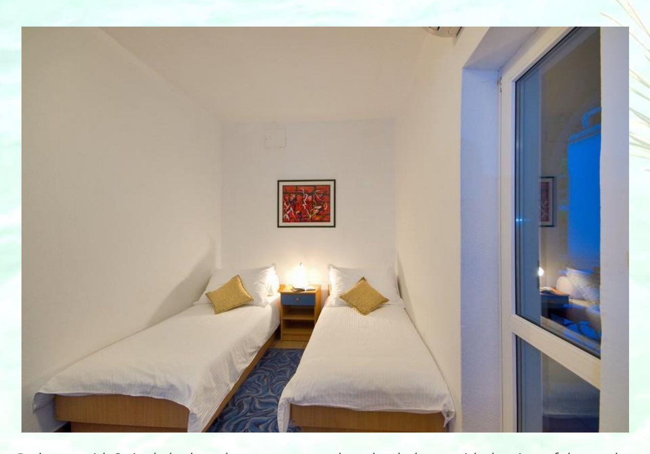
Bedroom with 2 single beds and an entrance to the other balcony with the view of the garden