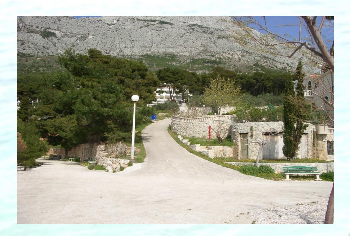
Path up the concrete road from the beach to the apartment, 140 m