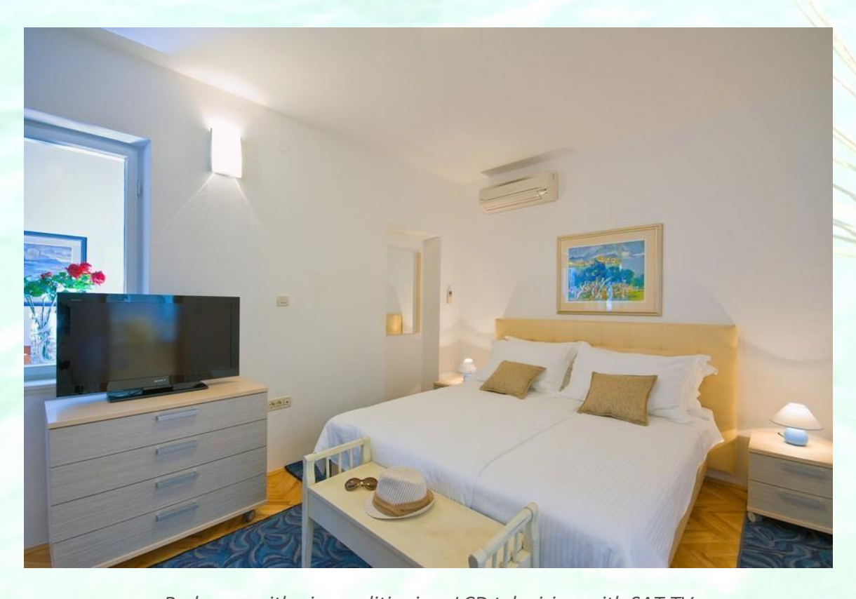
Bedroom with air-conditioning, LCD television with SAT TV