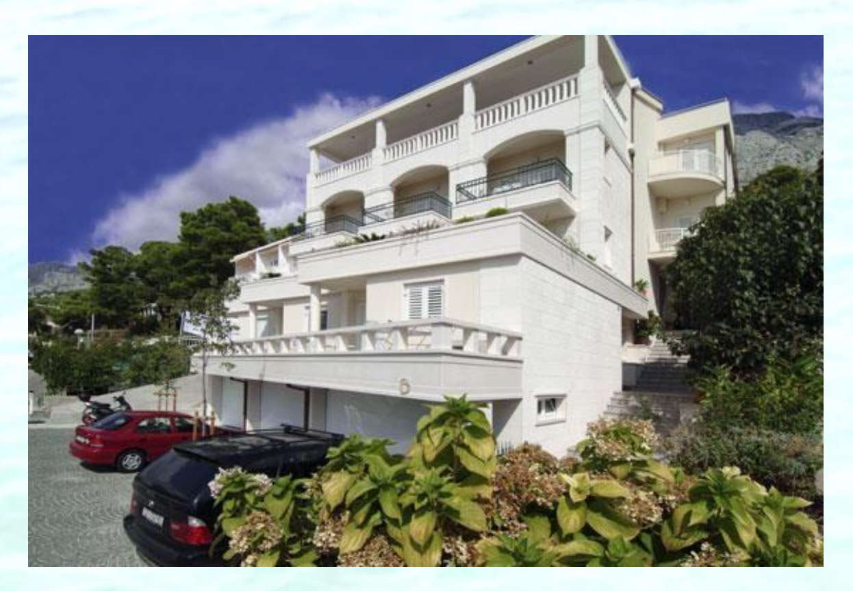
New house with garage for a few cars and secured parking lots across the street