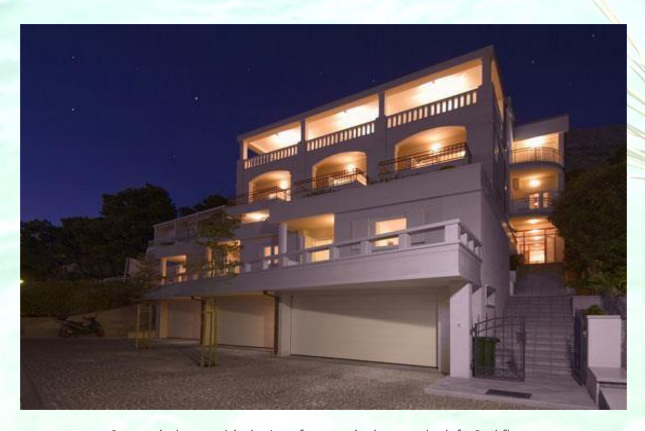
Square balcony with the iron fence – the last on the left, 2nd floor