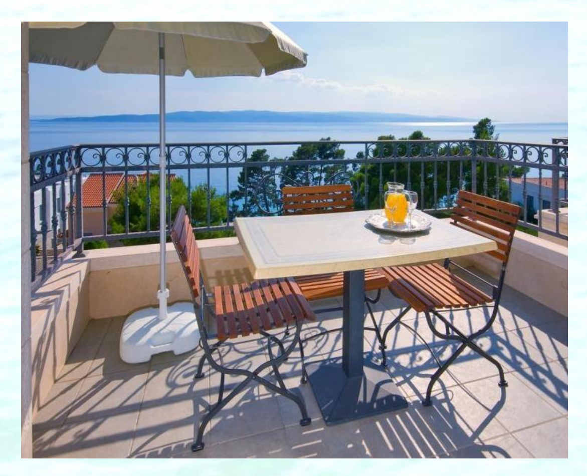
Beautiful view of the sea and island Brac from the balcony (there is another balcony with the view of the garden in this apartment)