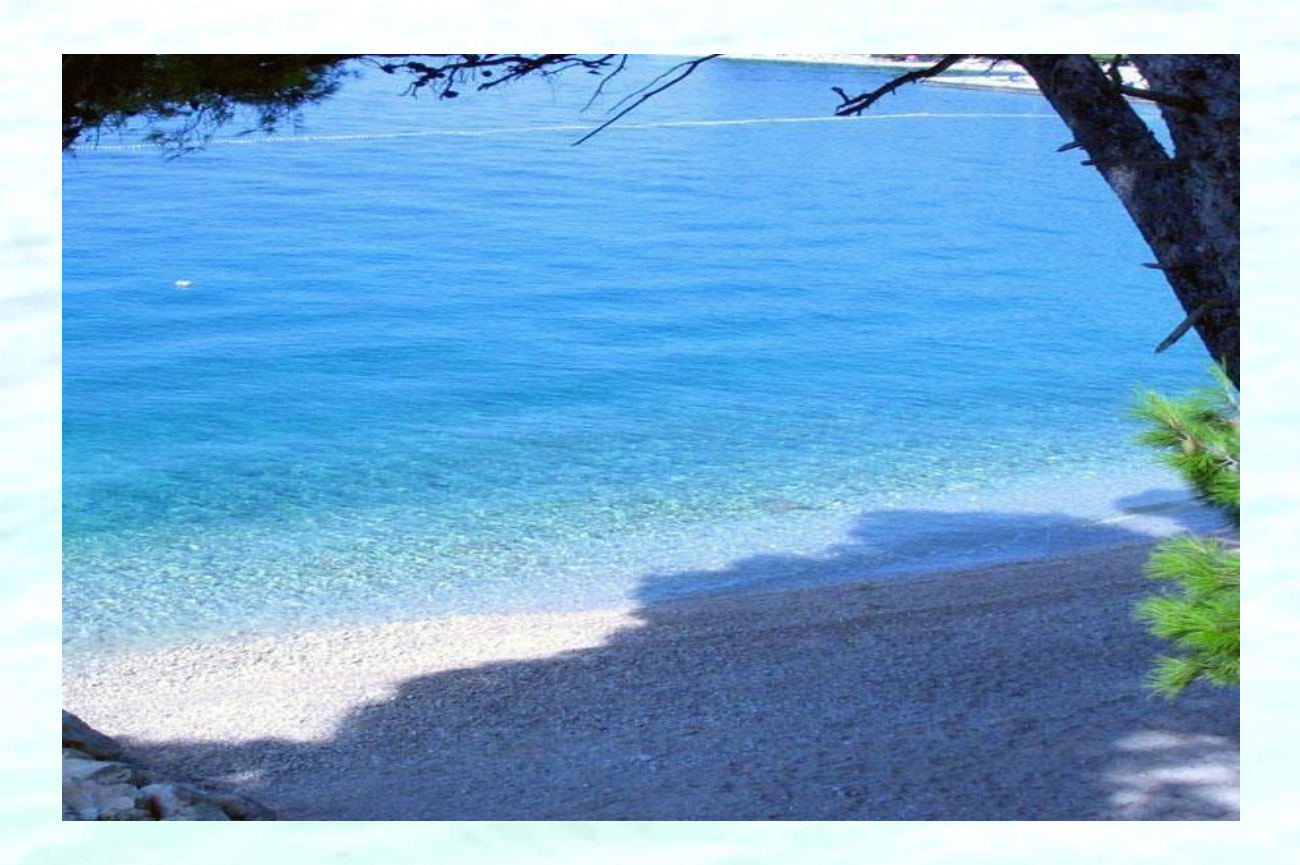
Pebble beach at 9 am, when the colours of the sea are magical