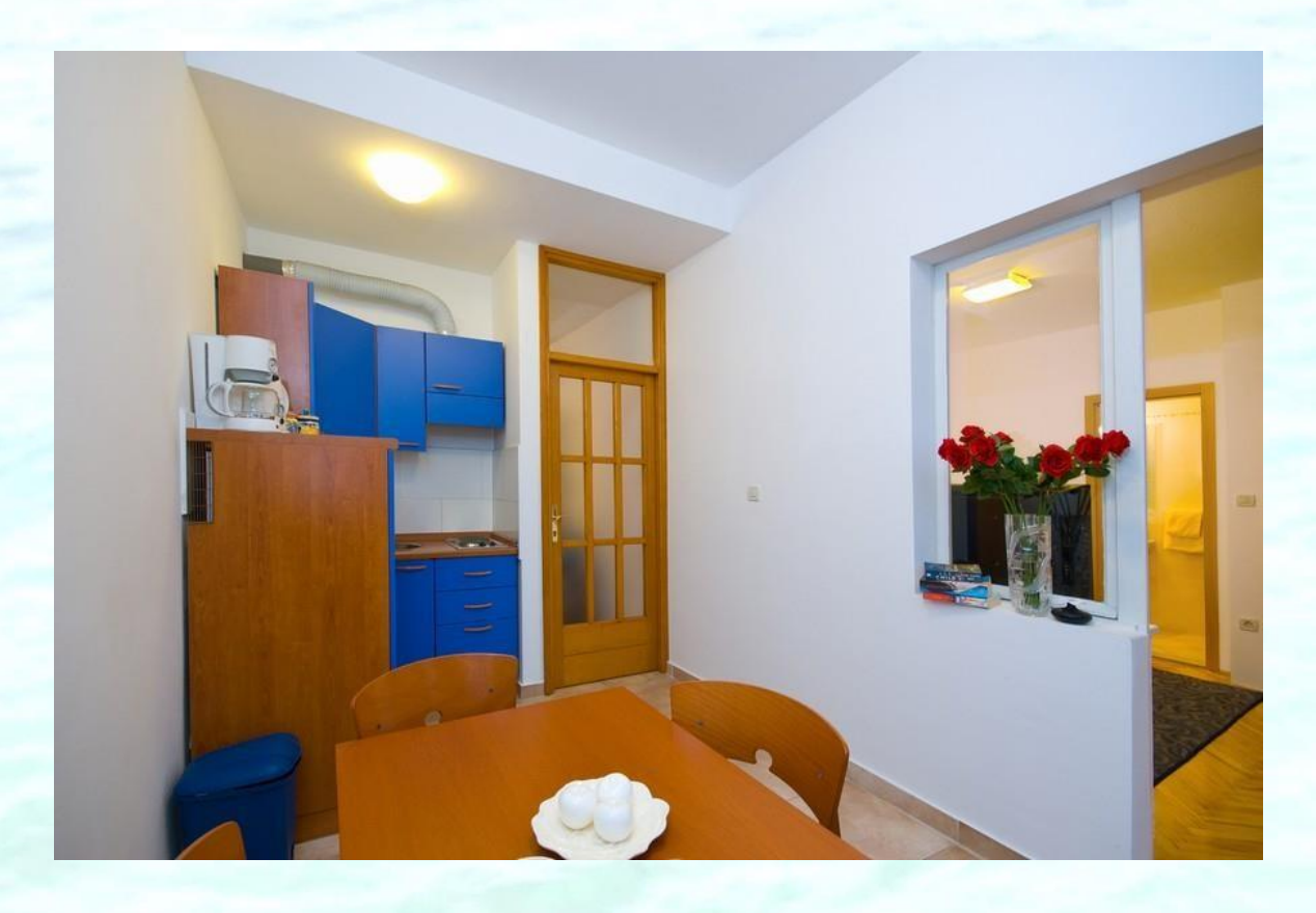
Kitchen area with a fridge and a built-in freezer