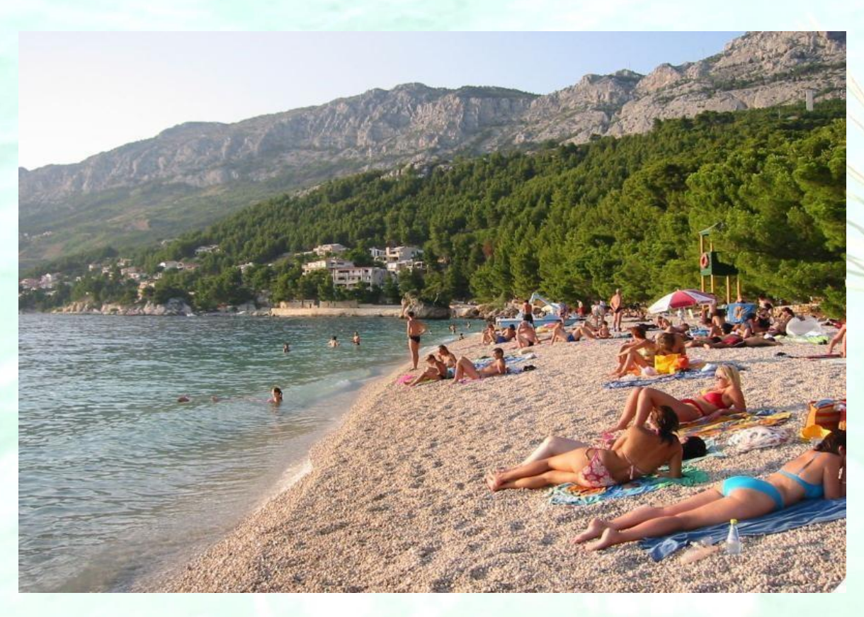
Afternoon sun on the pebble beach with the Biokovo mountains in the back