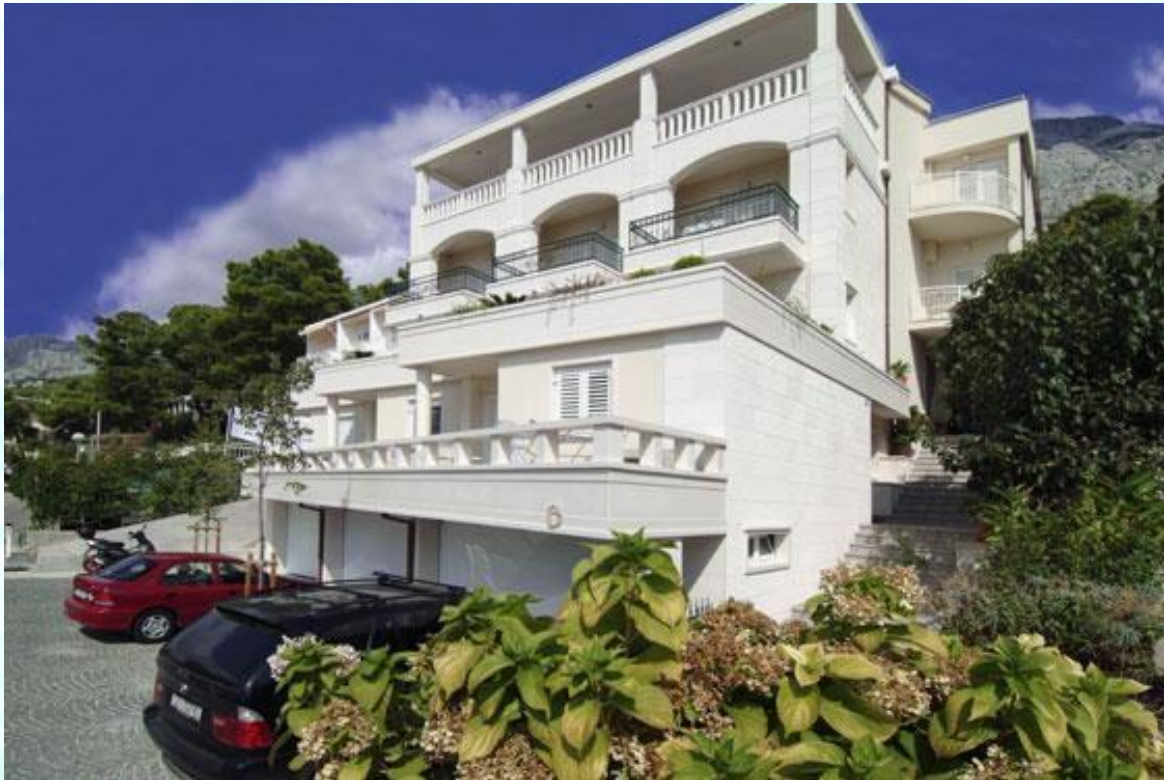
New house with garage for a few cars and secured parking lots across the street