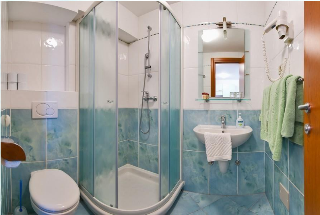
The bathrooms are the same in all apartments (shower and toilet), they come in different colours