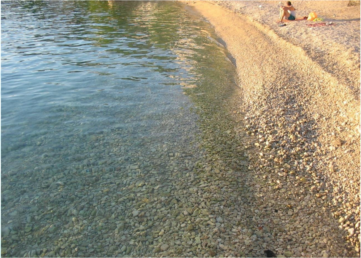
Picture 13: The children love the abundance of the pebbles on the Makarska Riviera