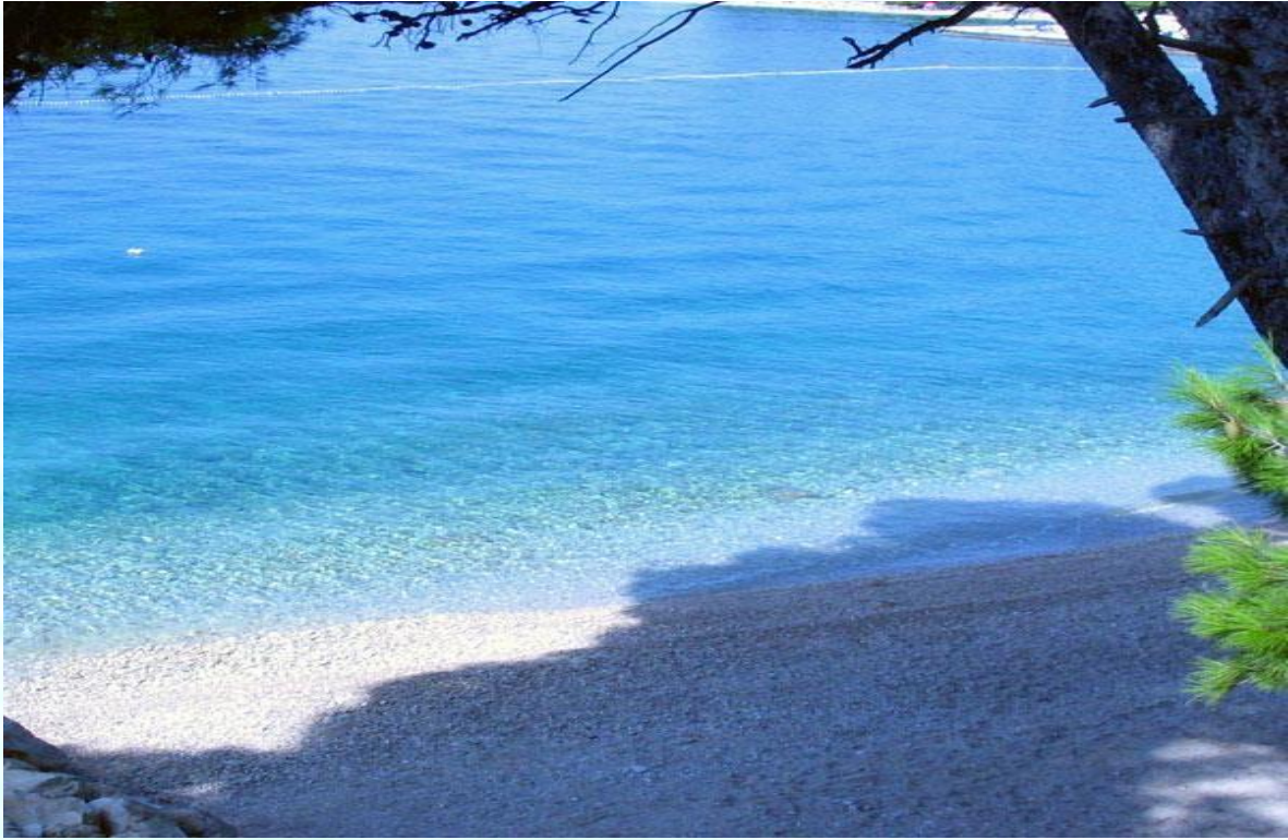
Picture 11: Pebble beach at 9 am, when the colours of the sea are magical