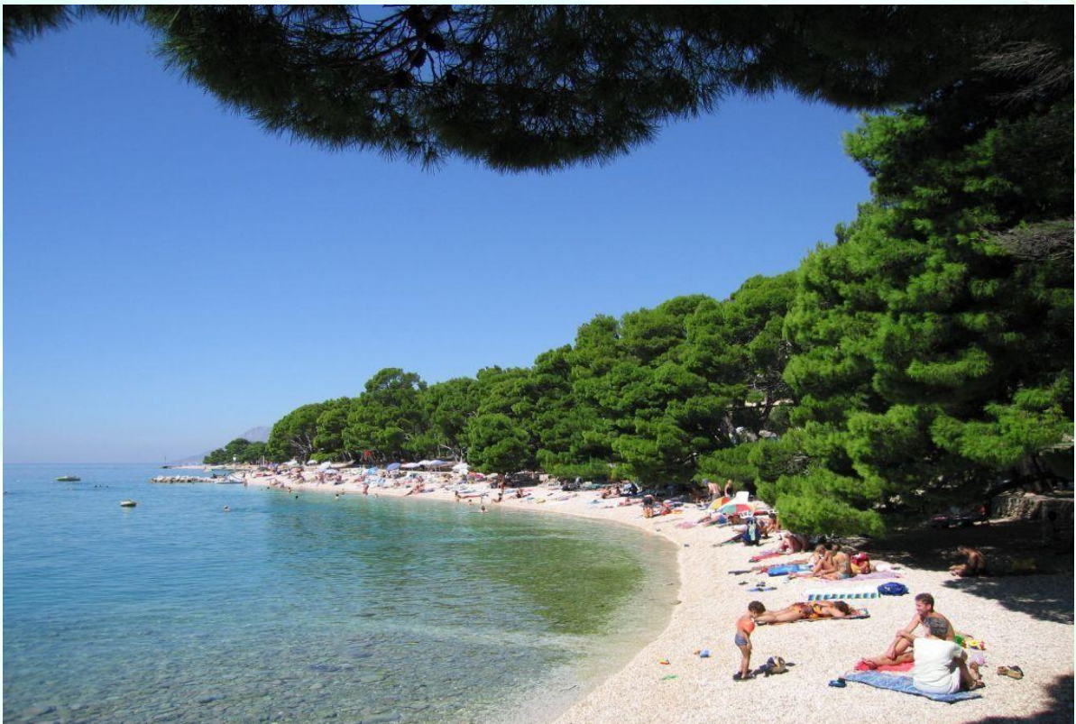
Picture 14: The beach in Brela was named Adriatic's most beautiful beach in 2005, (Lonely Planet)