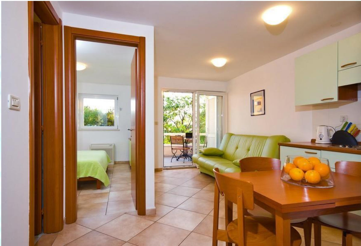
A view towards the living room area and the kitchen from the bedroom