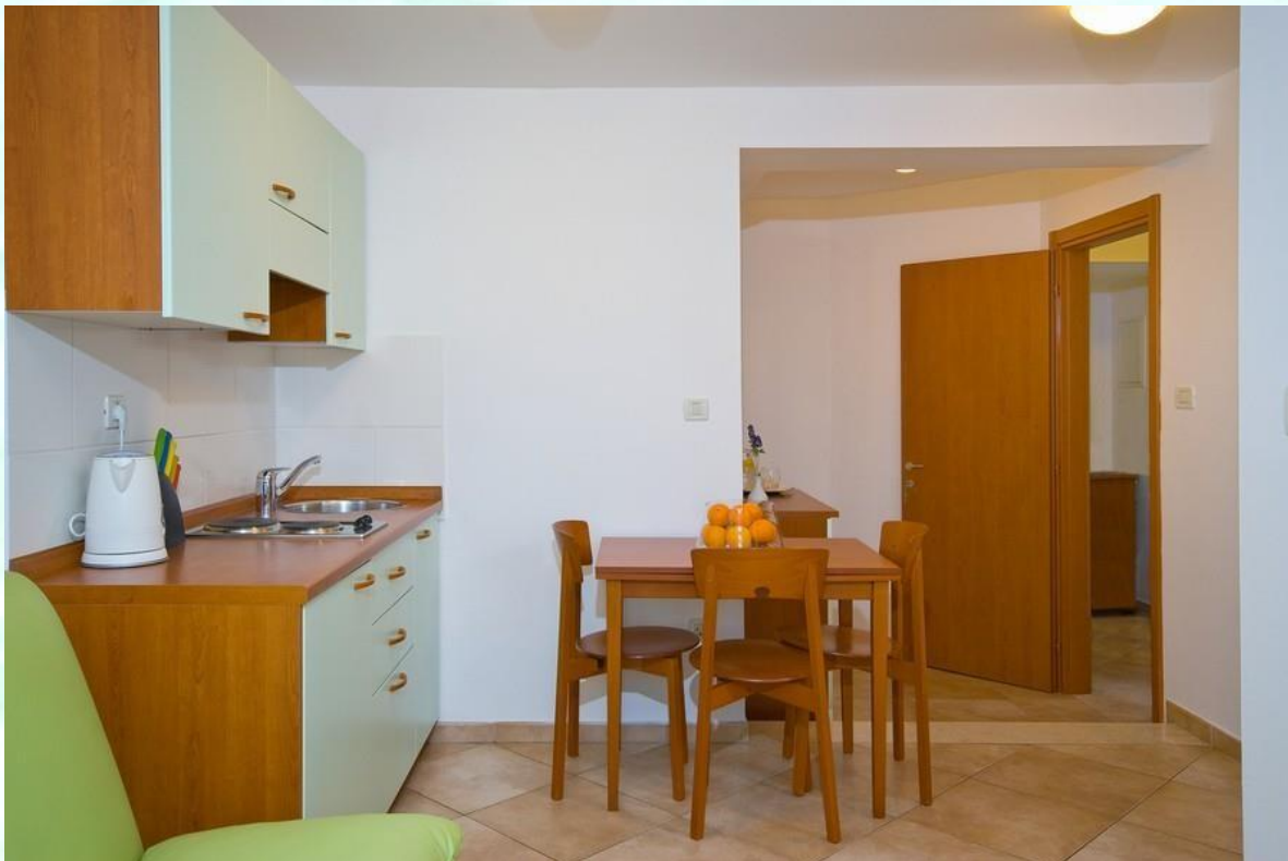
Kitchen area with a fridge and a built-in freezer