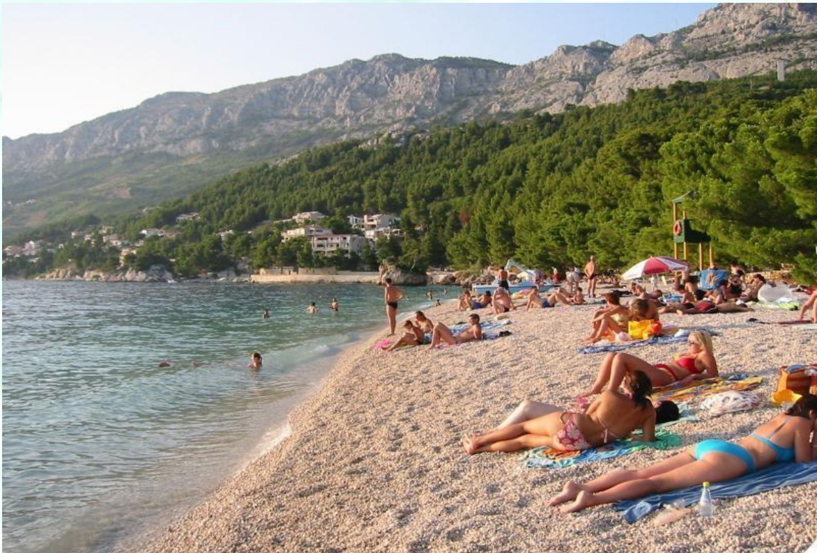
Picture 12: Afternoon sun on the pebble beach with the Biokovo Mountains in the back