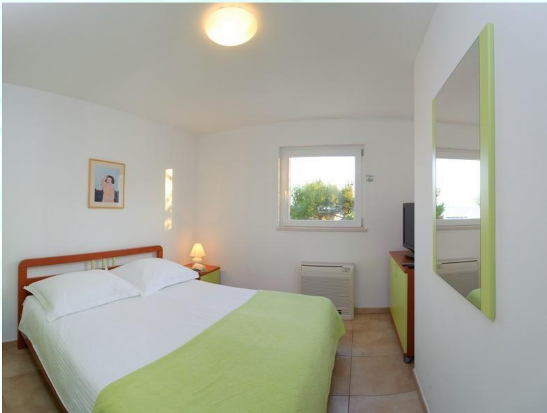
Comfortable bedroom to get a good sleep and afternoon nap!