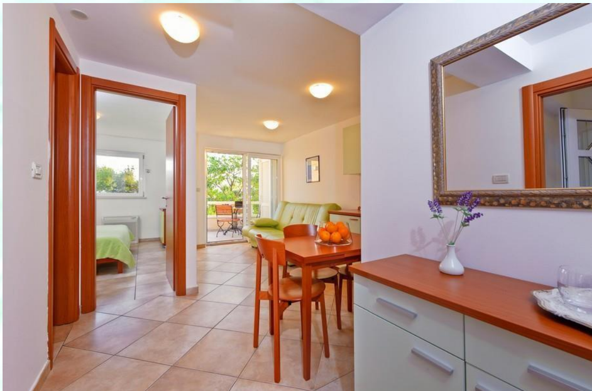
The kitchenette with dining room is on the right, straight is separated bedroom