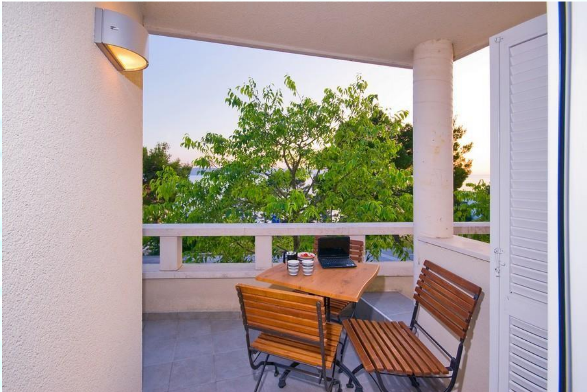
Beautiful balcony with the view towards the sea and trees