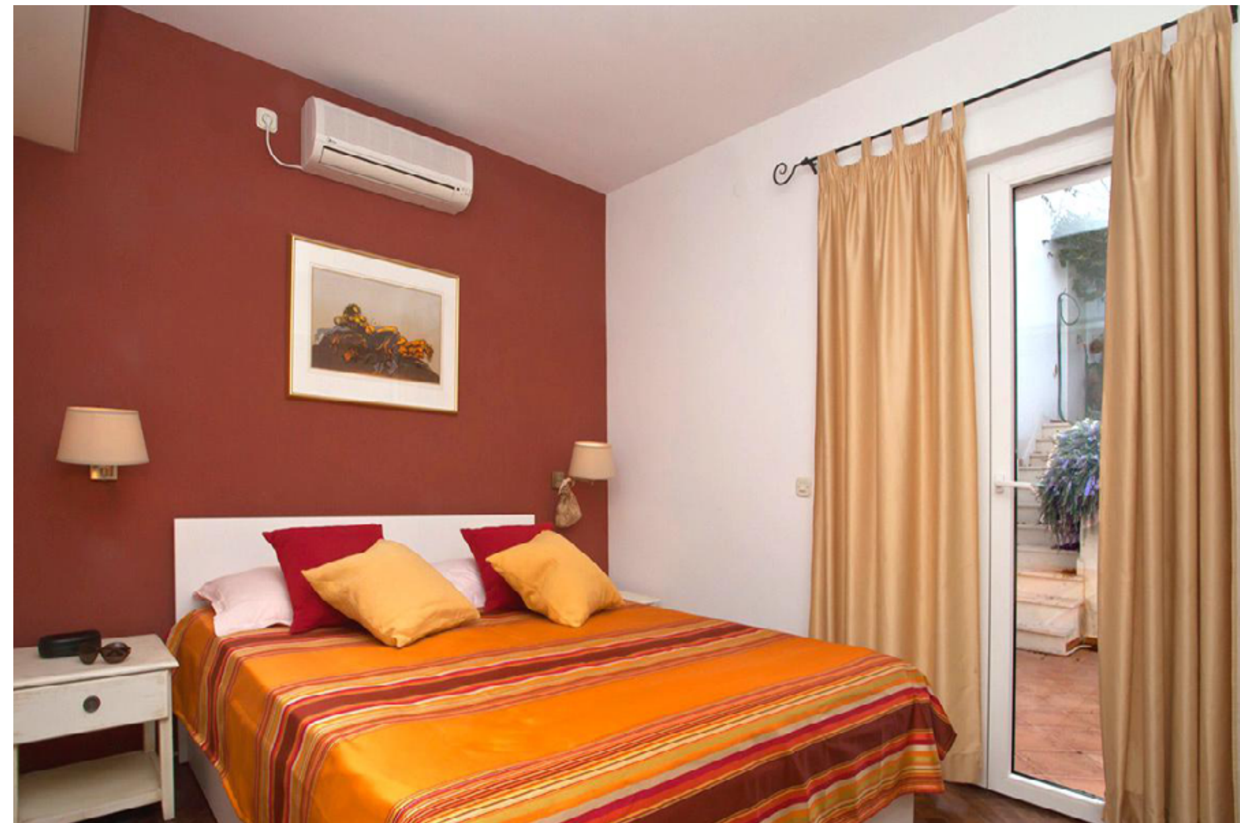
The romantic double bedroom guarantees a restful sleep.