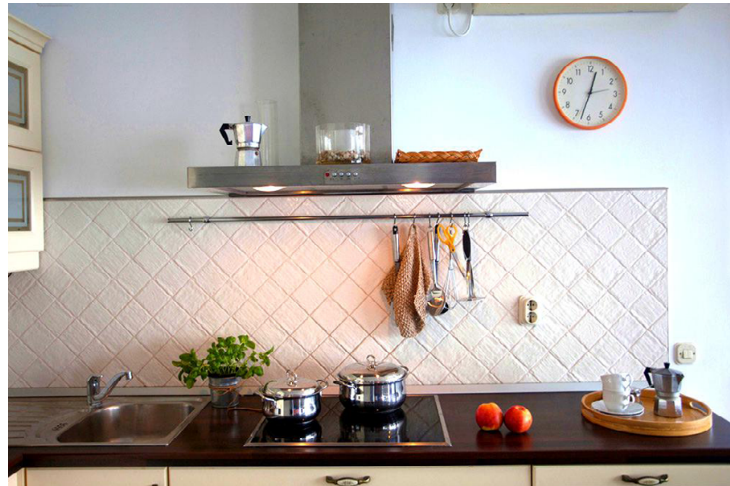
Enjoy cooking in this fully equipped kitchen and surprise your family with a delicious meal.