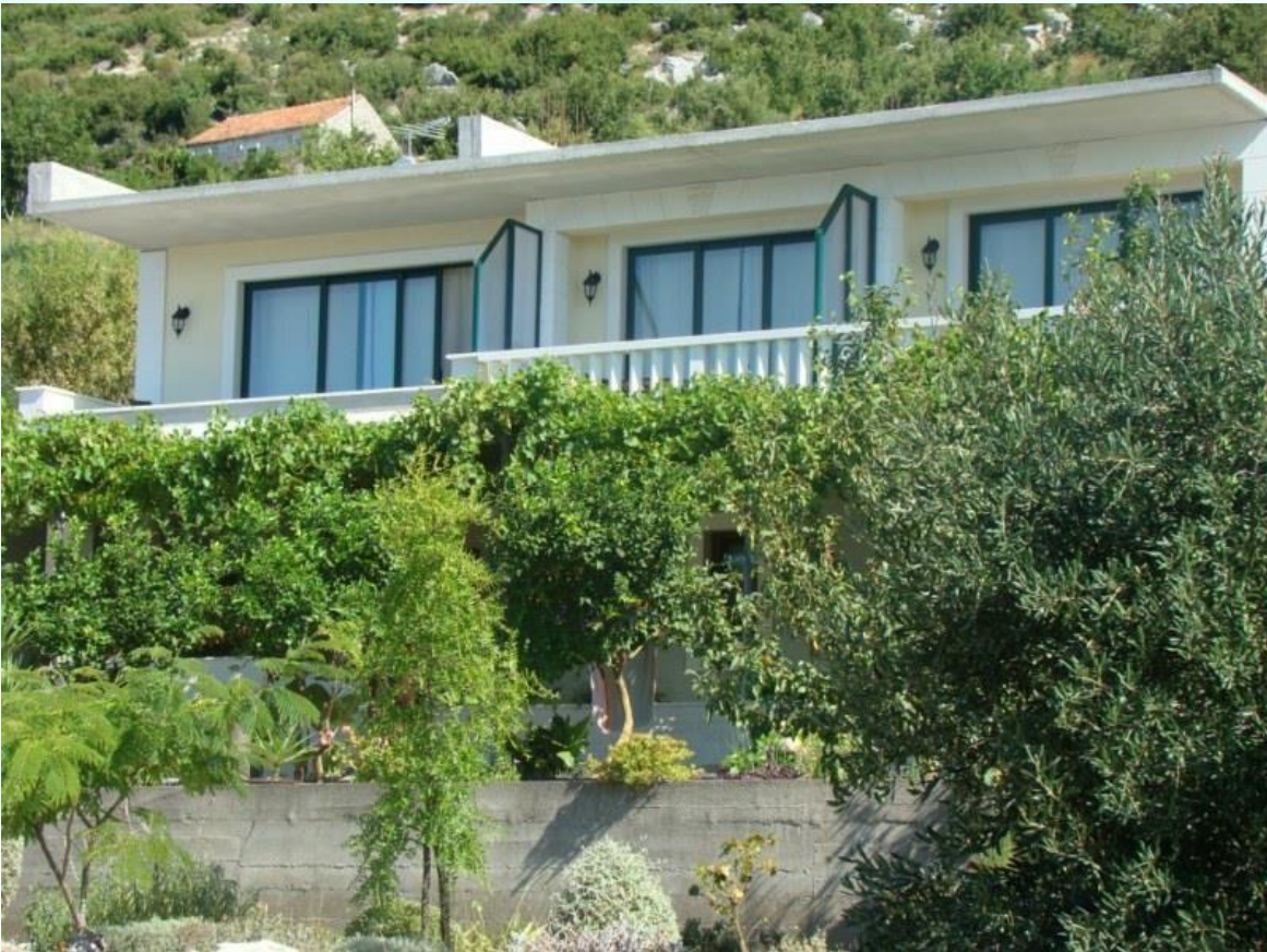
Picture 5: Apartments Hedonist on the 1st floor – the orange one is the first on the left