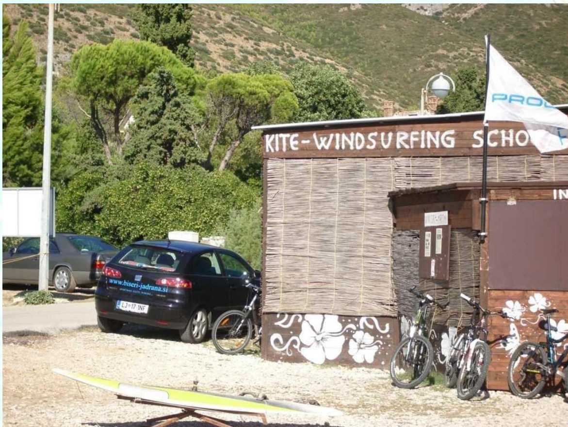
Picture 11: Kiting and surfing school near the apartments – adventure guaranteed!