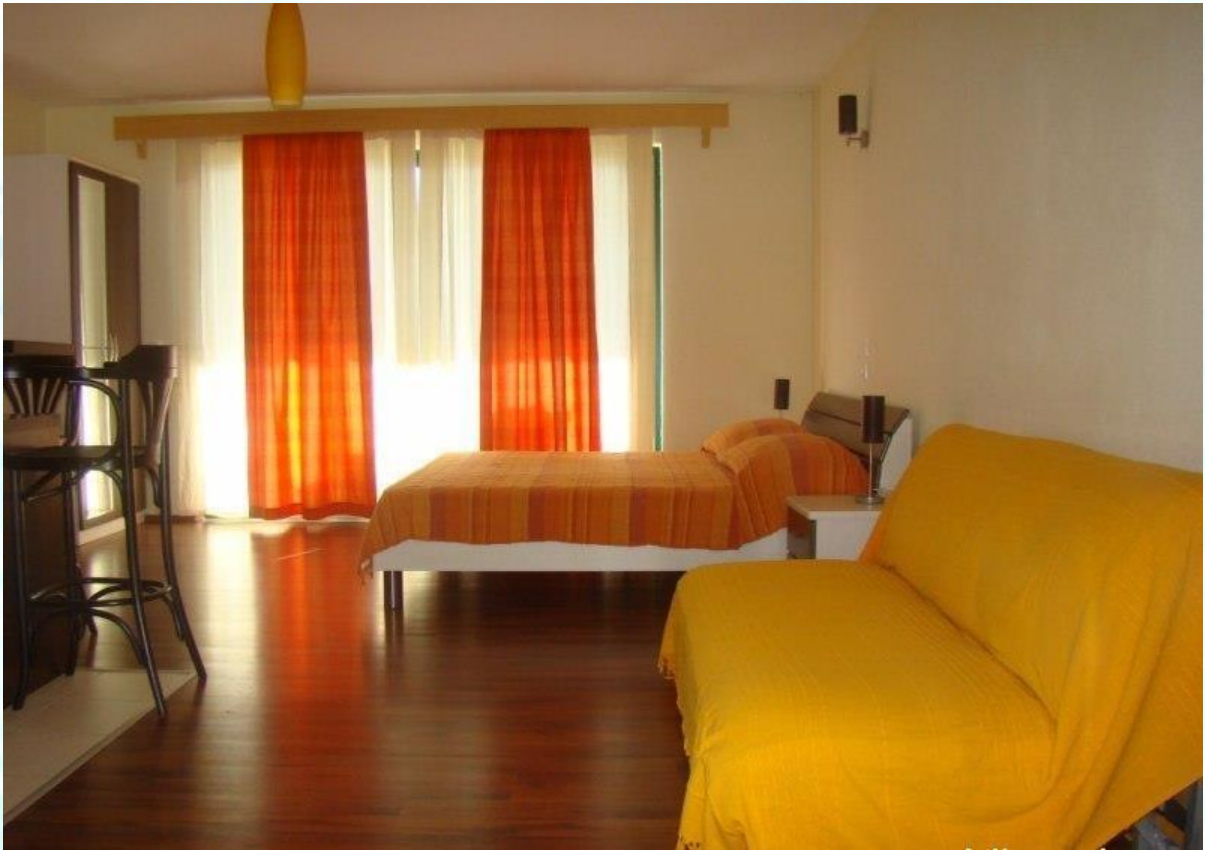
Picture 2: Orange studio apartment (33m 2 ) with a comfortable double bed and a pull-out sofa