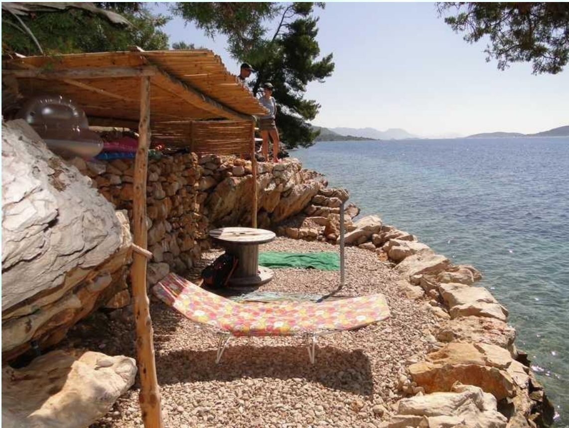
The private beach built by the owner and his family