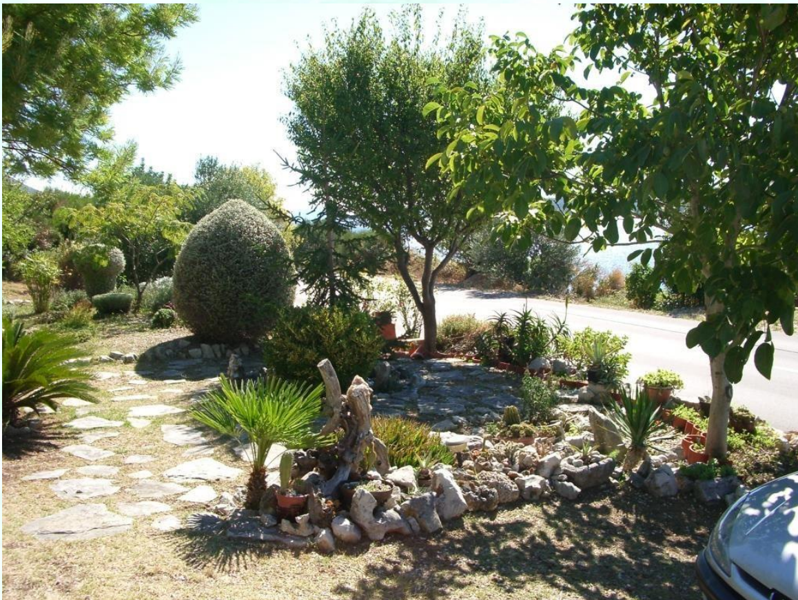
Picture 13: Mediterranean garden in front of the apartments with an aromatic scent