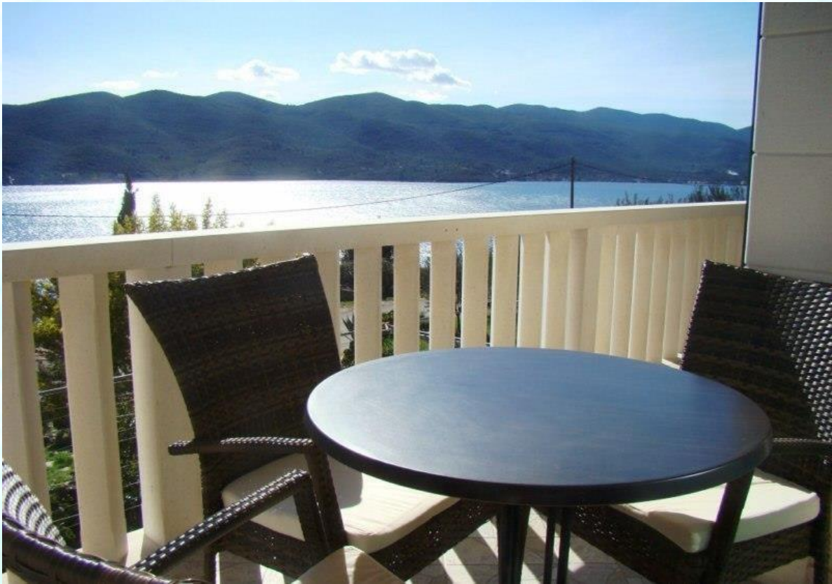
Picture 6: A lovely balcony of the studio apartment with a breathtaking view