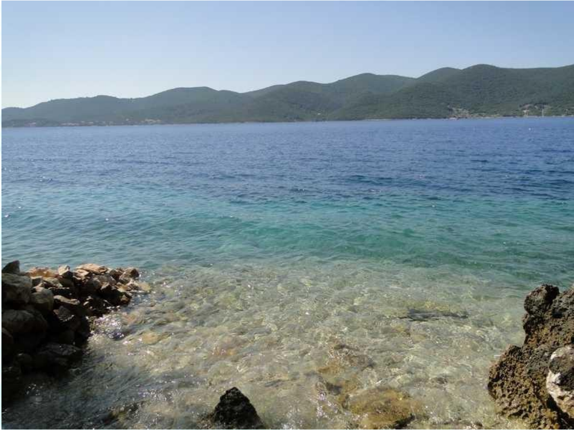
Entrance to the sea at the private beach