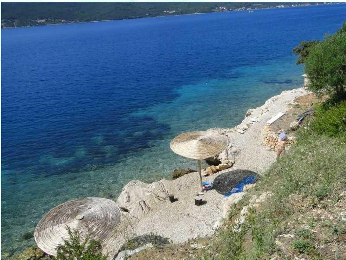
A view of the private beach with sun shades