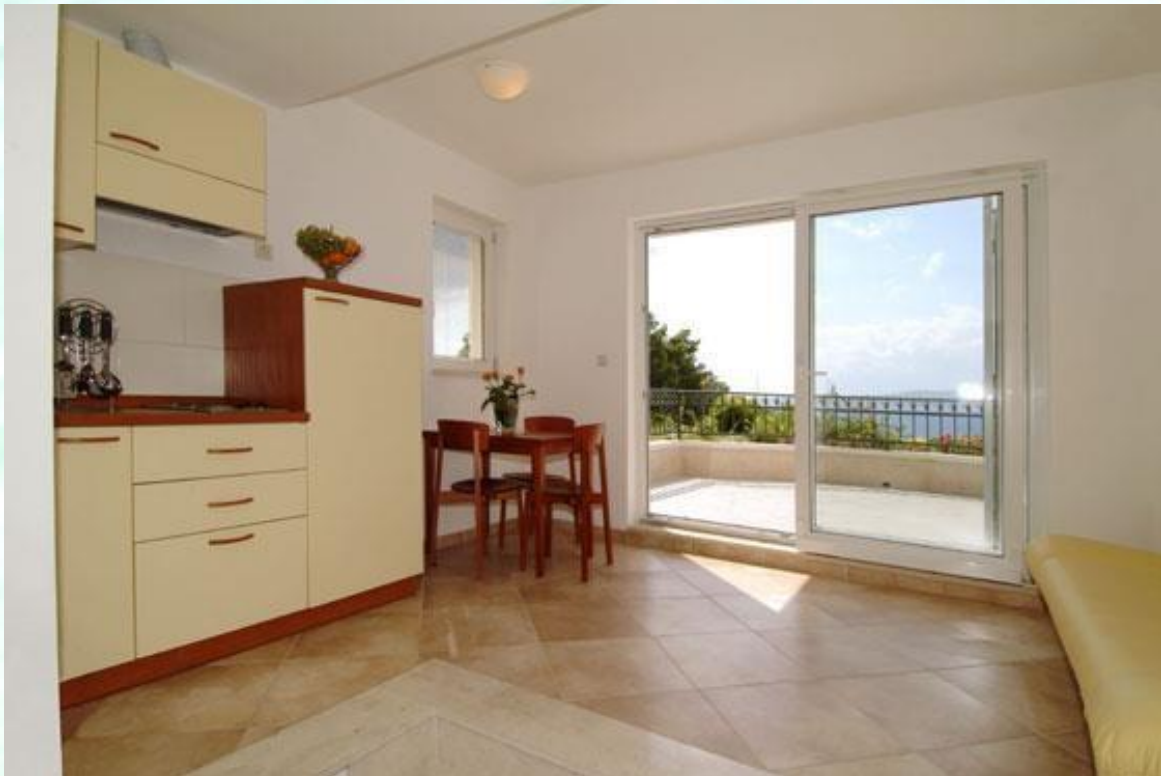
The kitchenette with dining room is on the left, on the right of the photo is the pull-out sofa