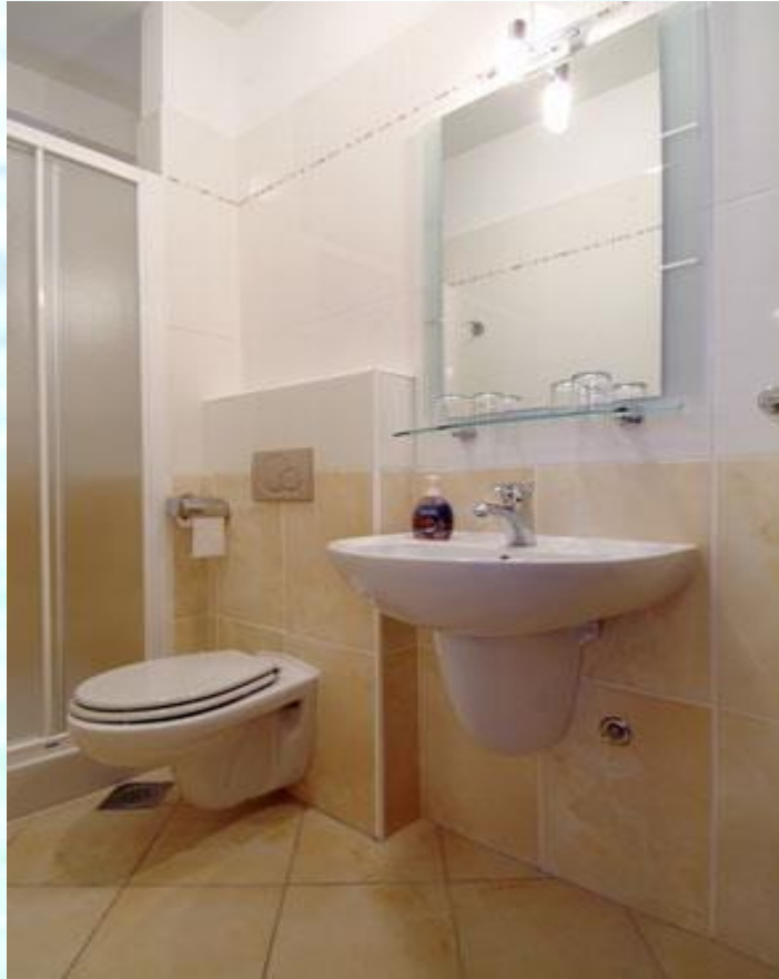
The bathrooms are the same in all the apartments (shower and toilet), they come in different colours