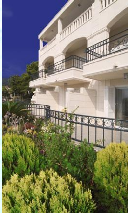
The balconies of the house