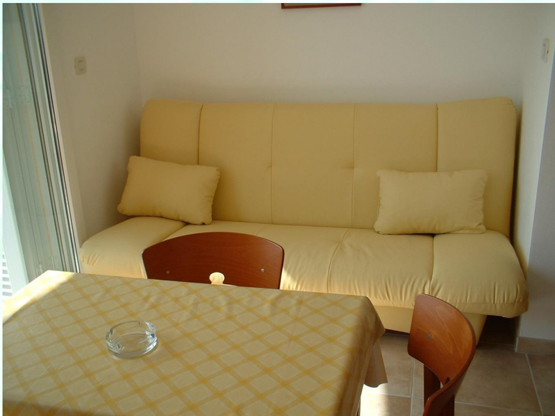
A pull-out sofa (140x200) in the living room area