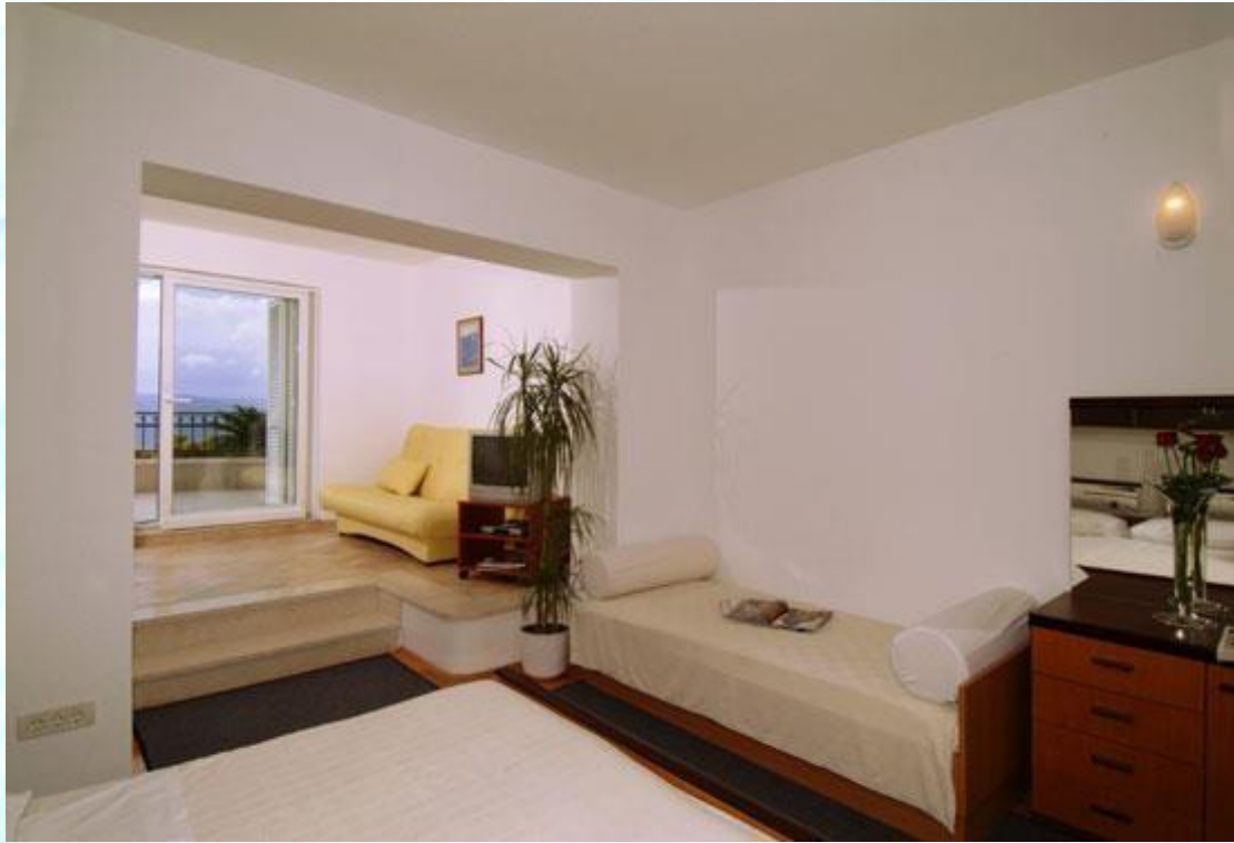
Bedroom with the double bed and an additional bed for 1 person