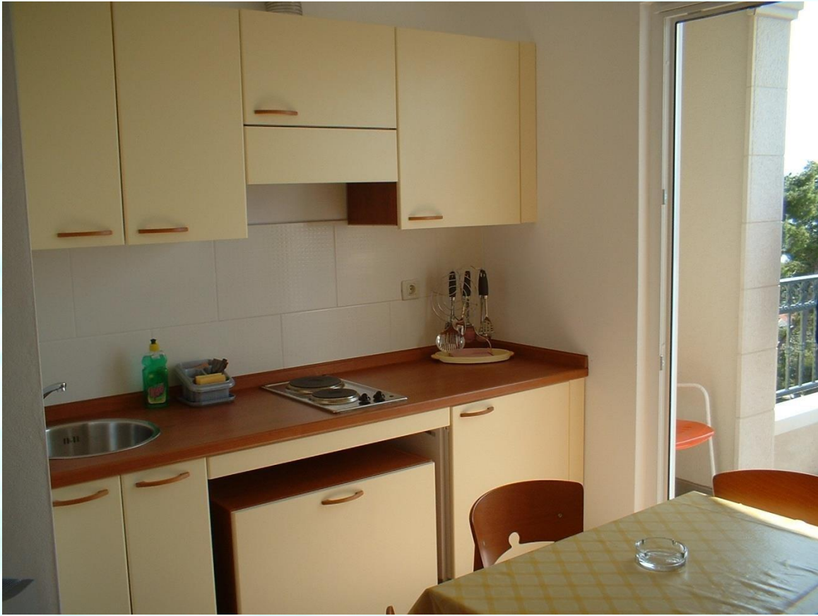
Kitchen area with a fridge and a built-in freezer