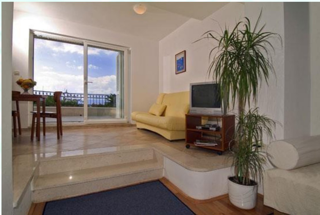
A view towards the living room area and the kitchen from the bedroom