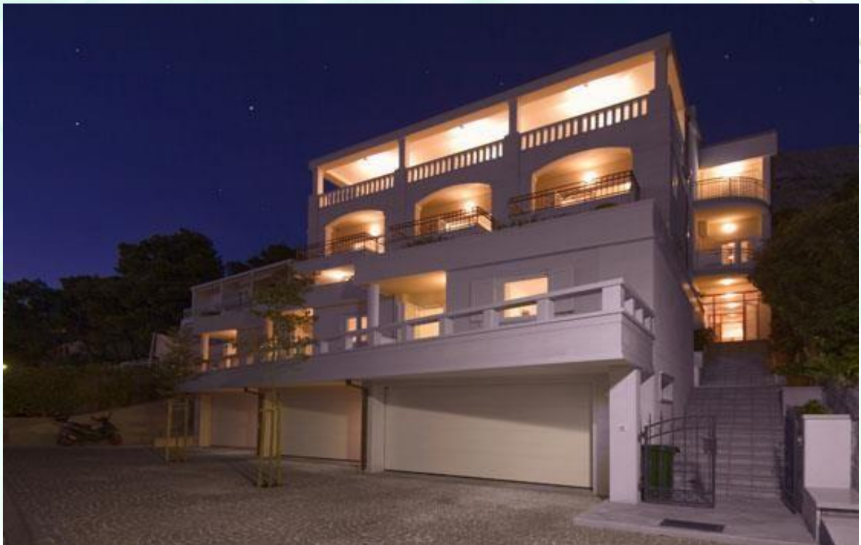
Picture 9: Square balcony with the iron fence – the last on the left, 2nd floor