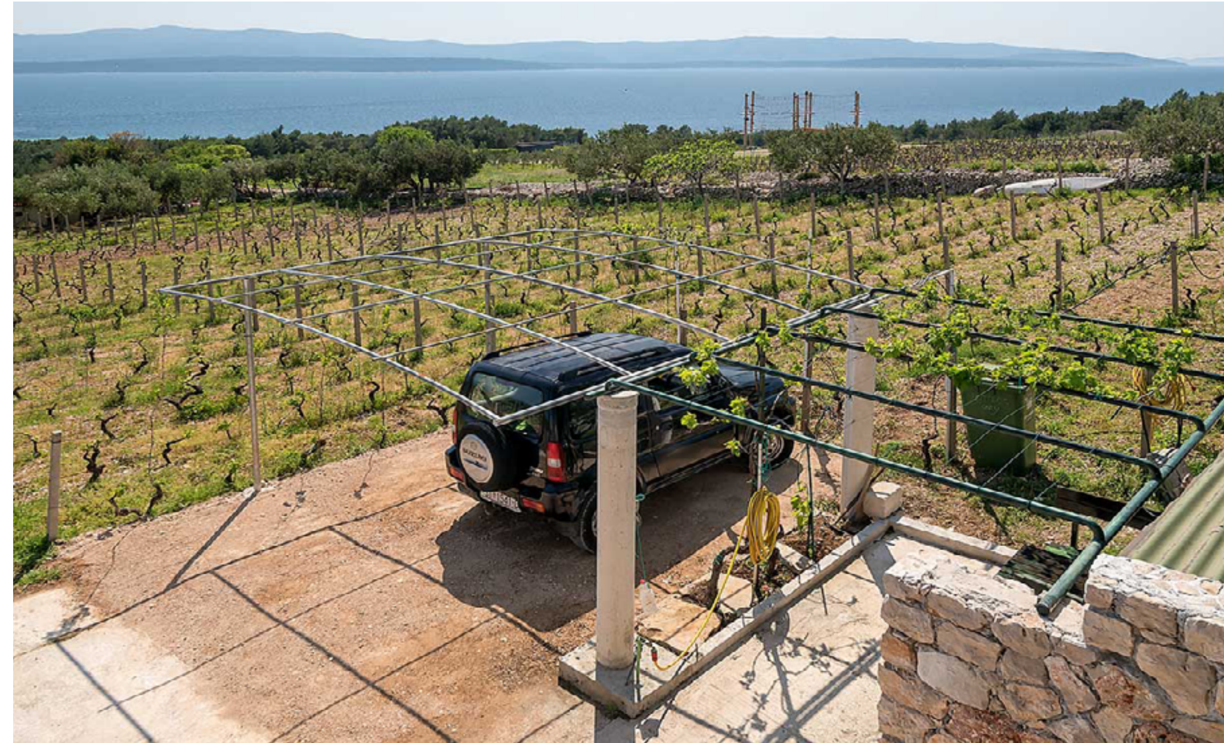
Parking spot next to the house