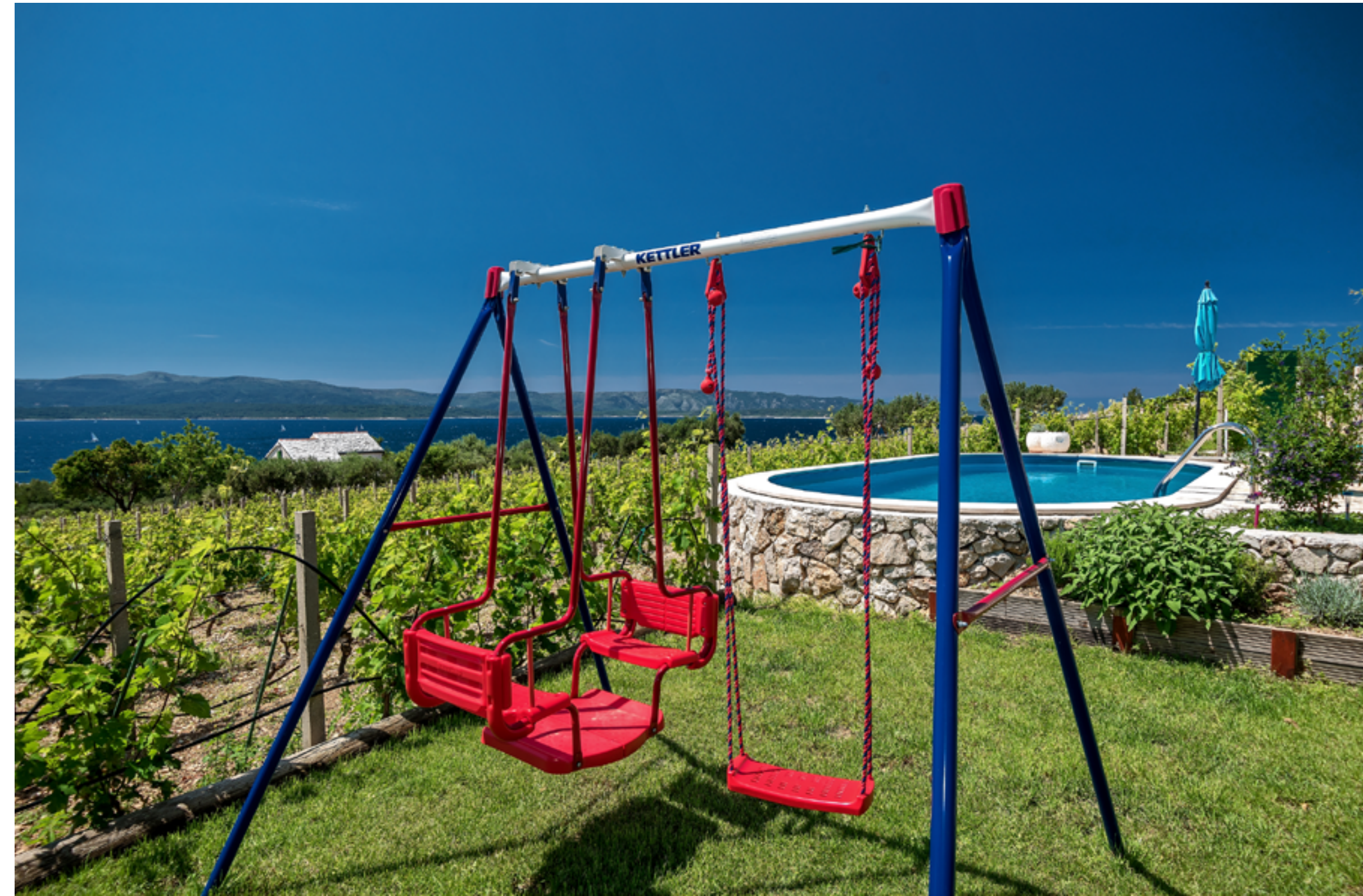
While you are enjoying in the pool, your children can play on the swing.