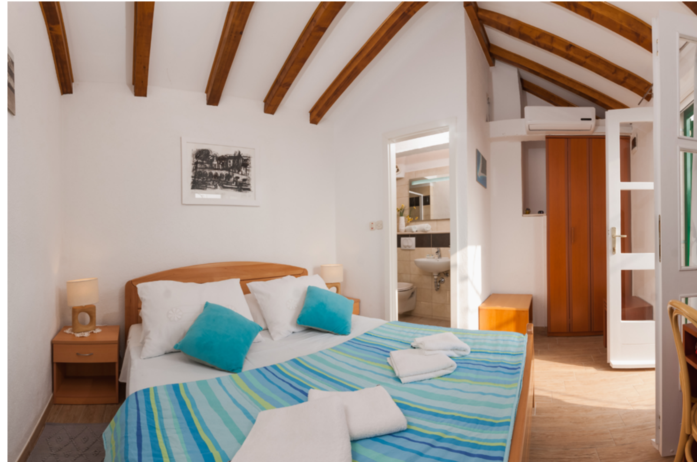
The second double bedroom with en suite bathroom and exit to the terrace