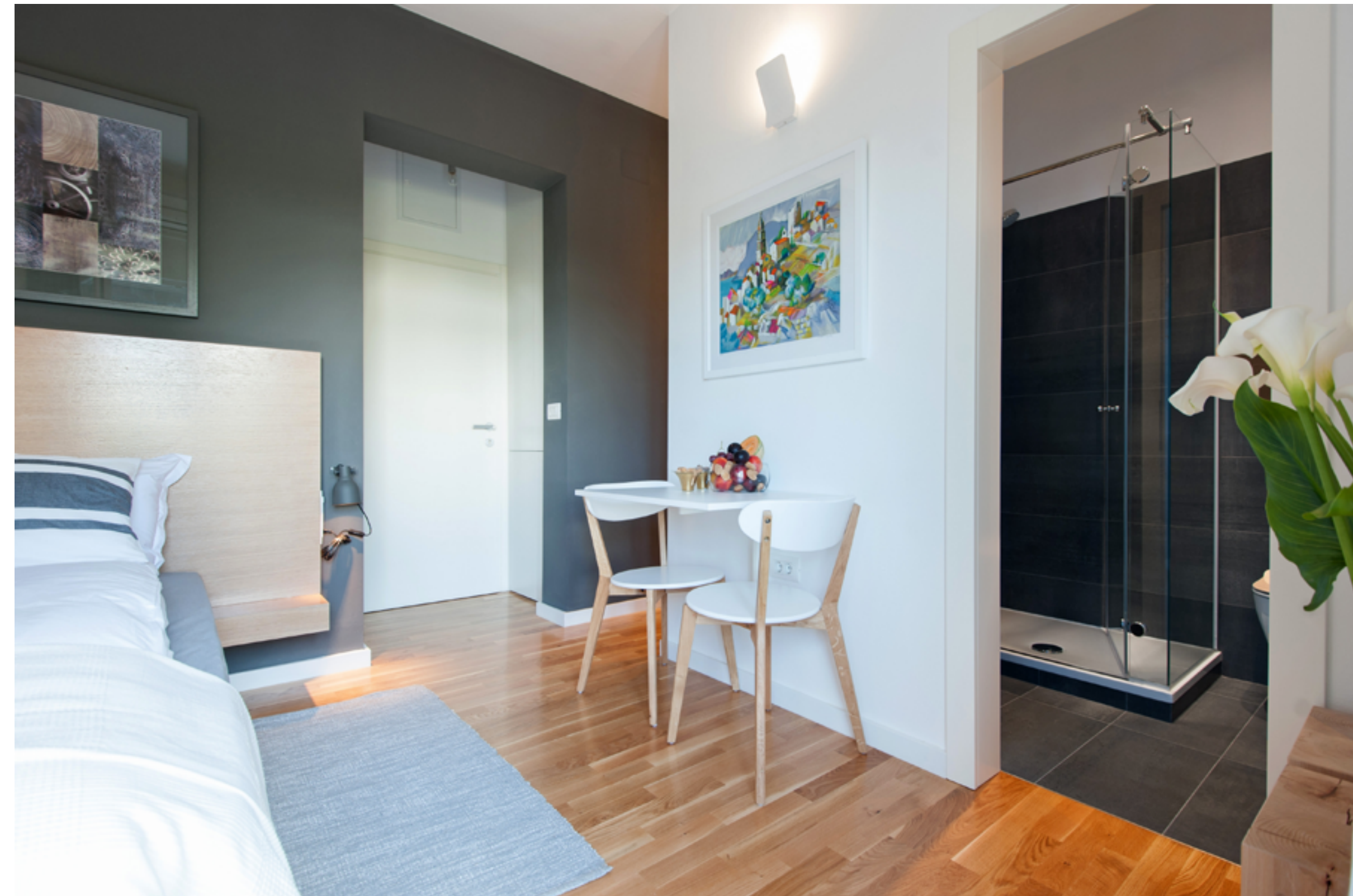
Next to the bedroom is the dining corner and a en-suite bathroom with shower