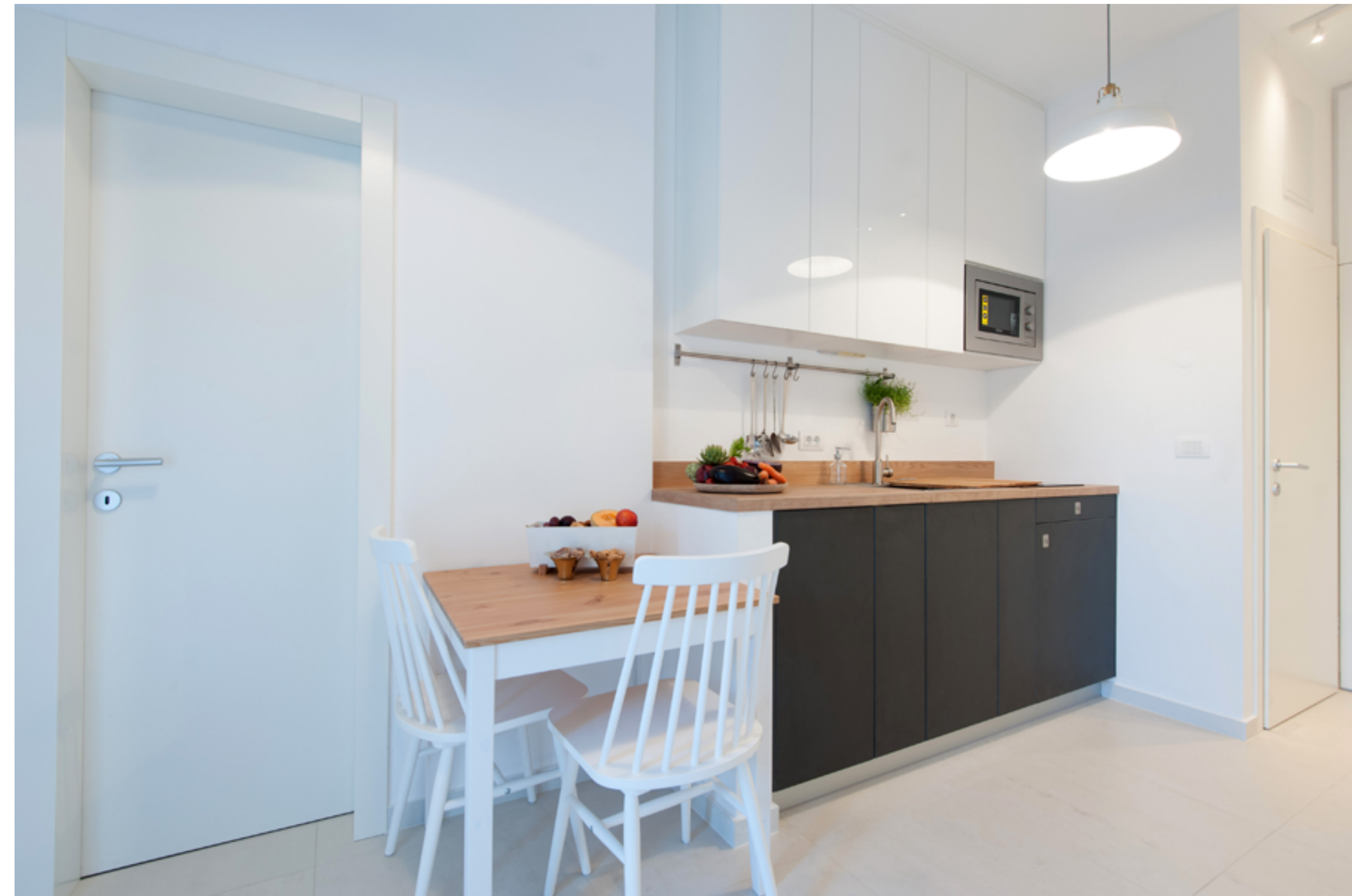
Lovely kitchenette with dining corner