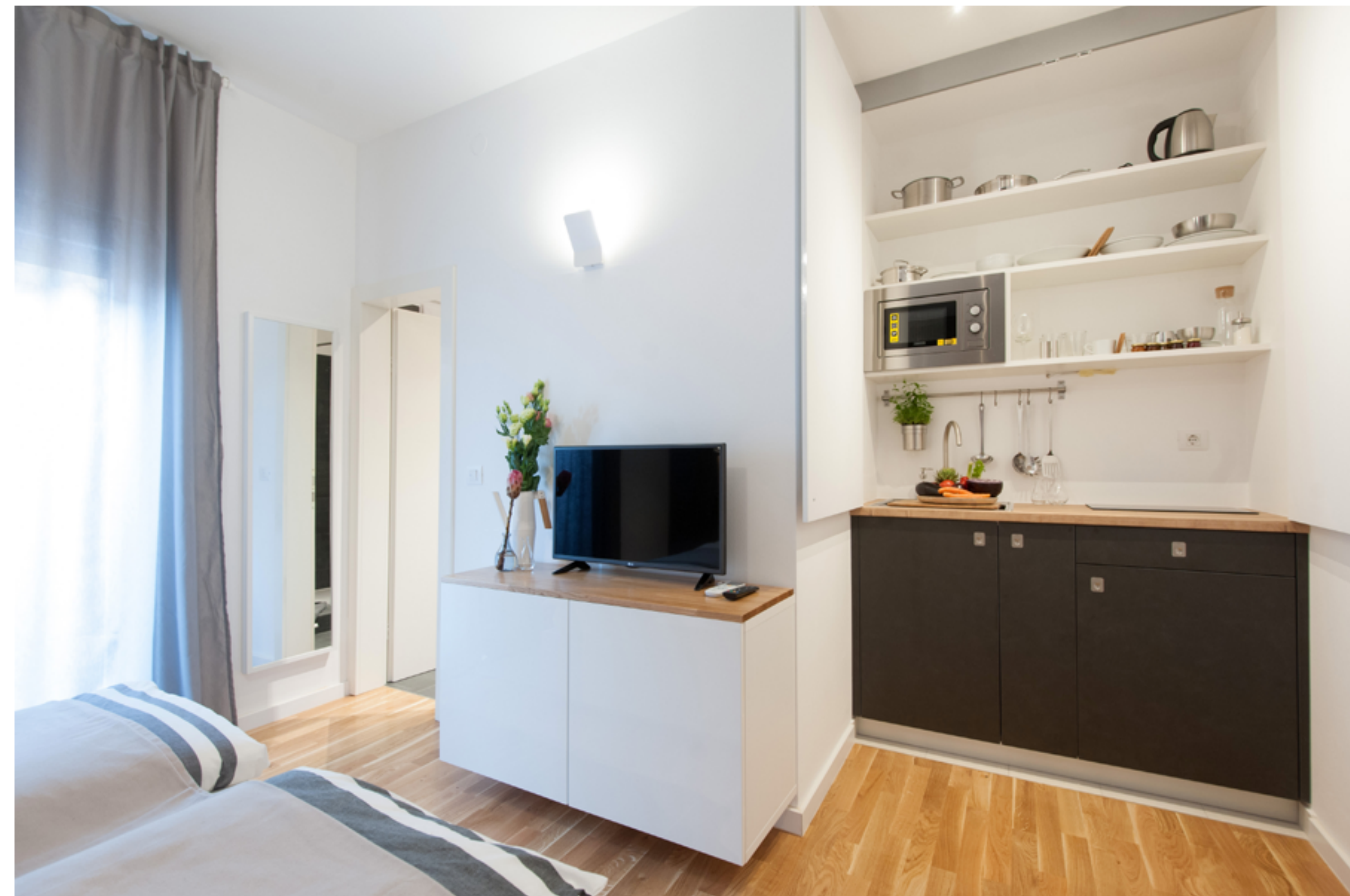
The kitchenette will turn you into a real chef de cuisine while on holiday