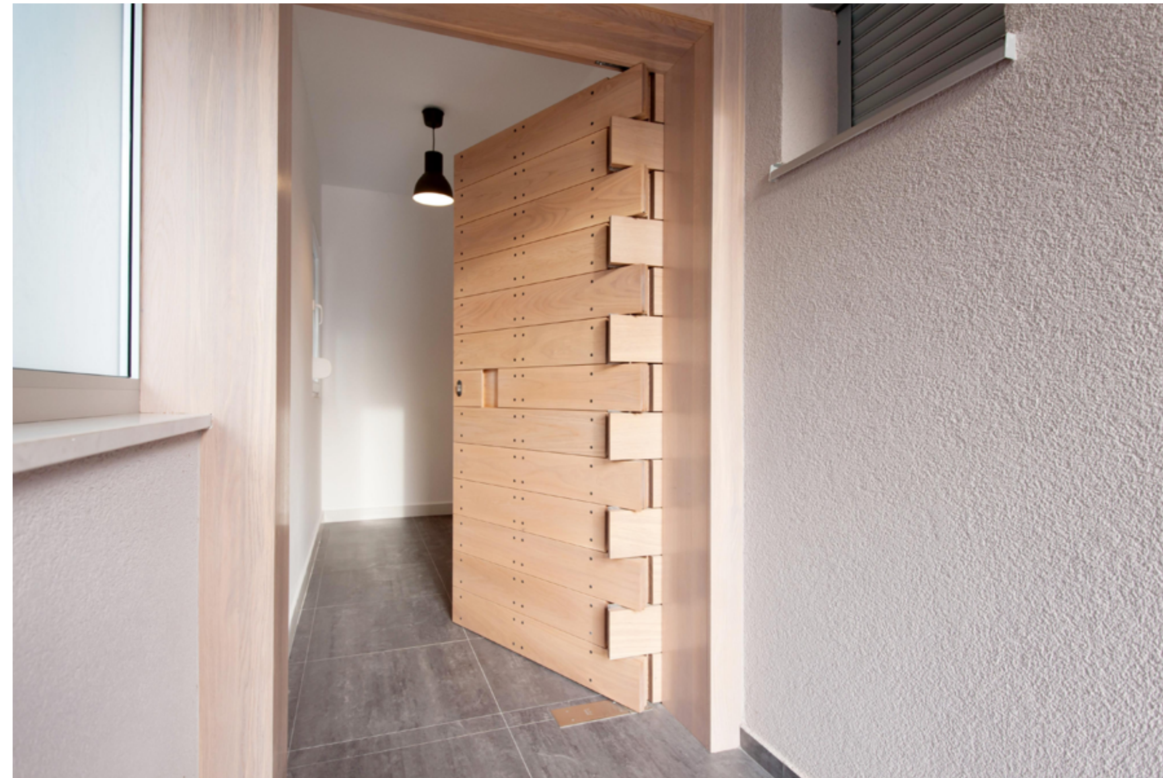
An elegant door welcomes you into the vacation house