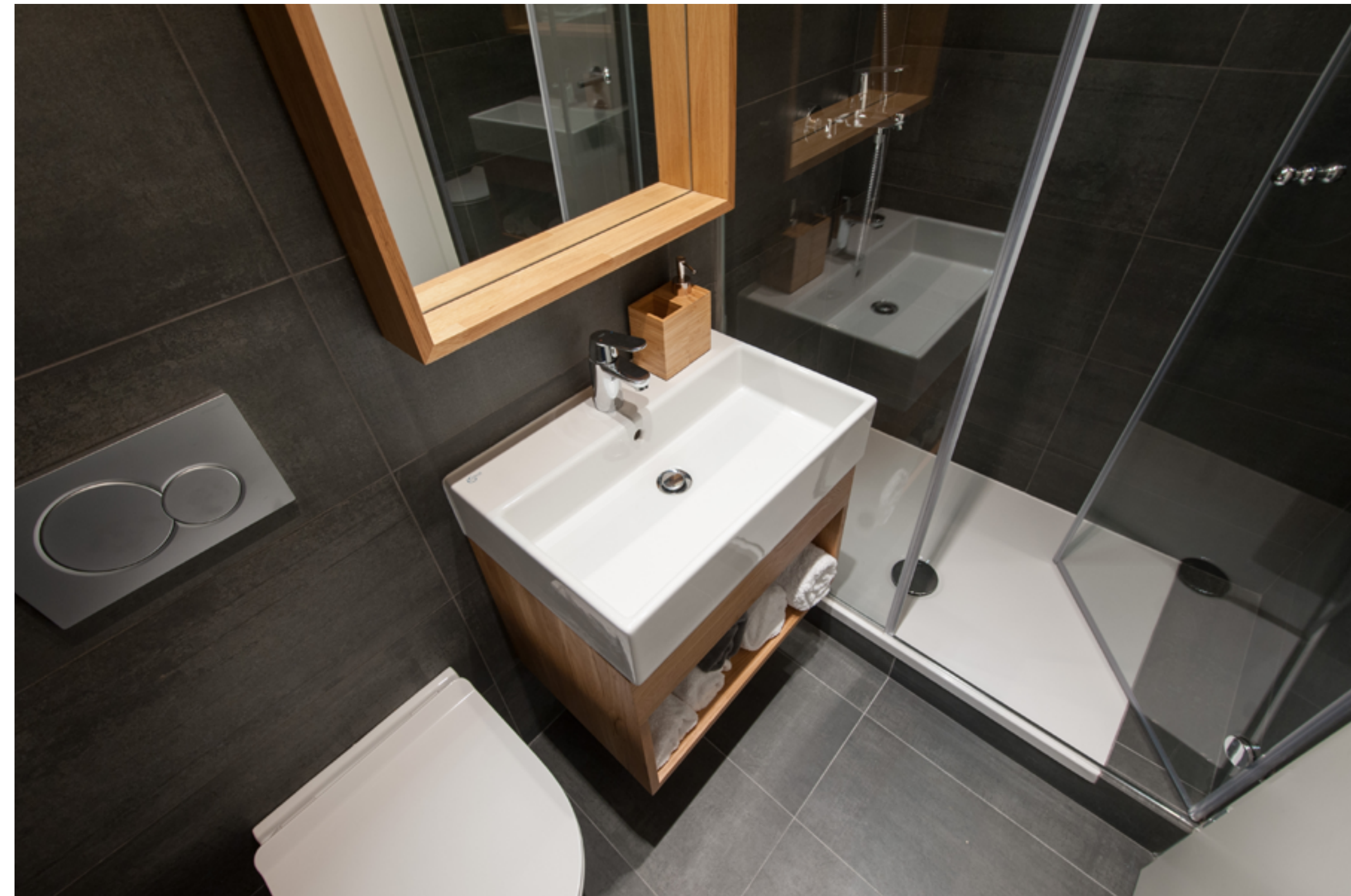
Modern equipped bathroom with shower