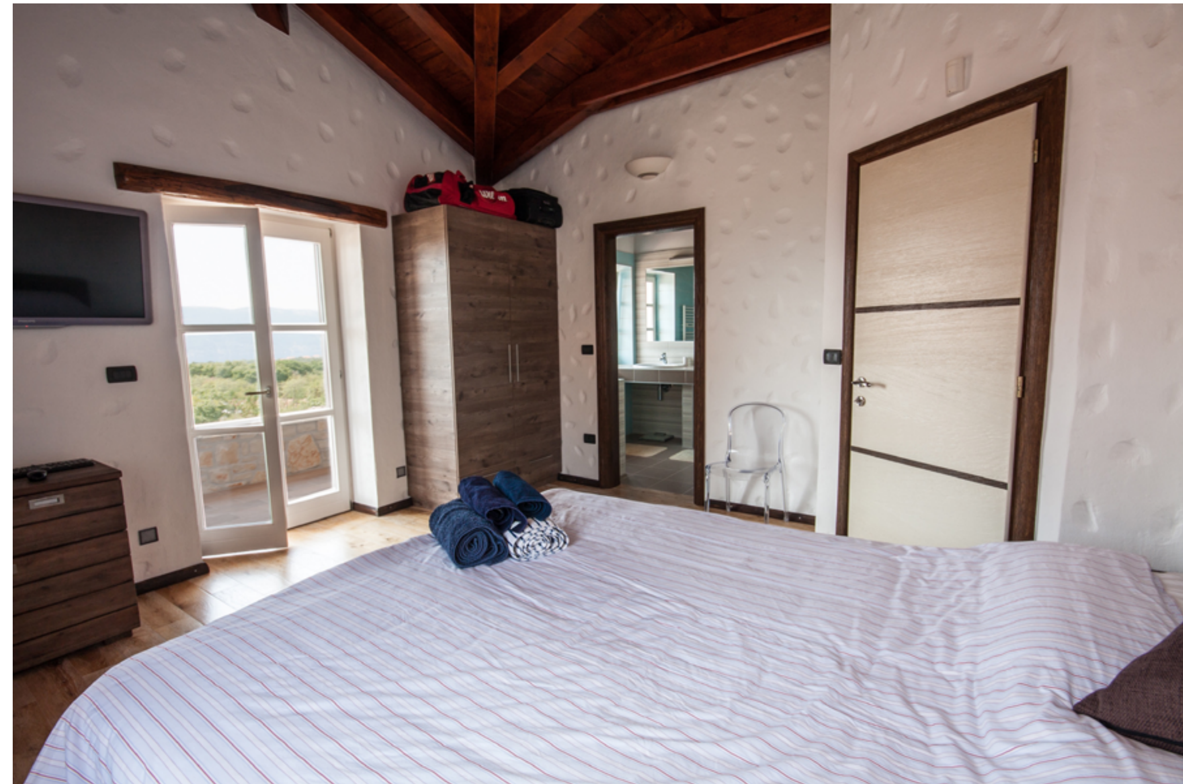
Second comfortable bedroom with direct access to the balcony