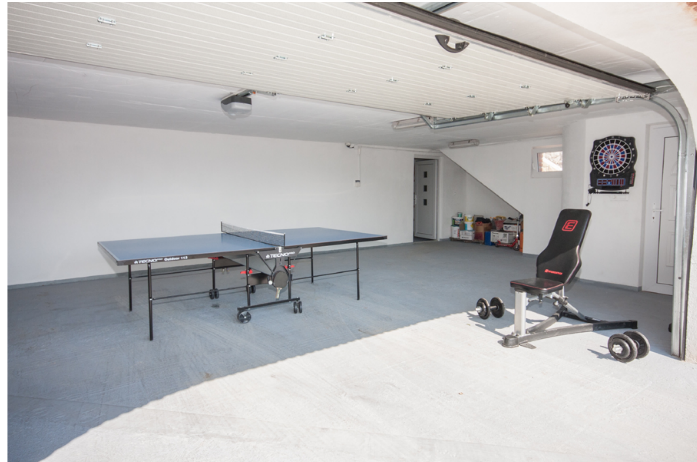
Sport lovers can enjoy fitness or a round of table tennis