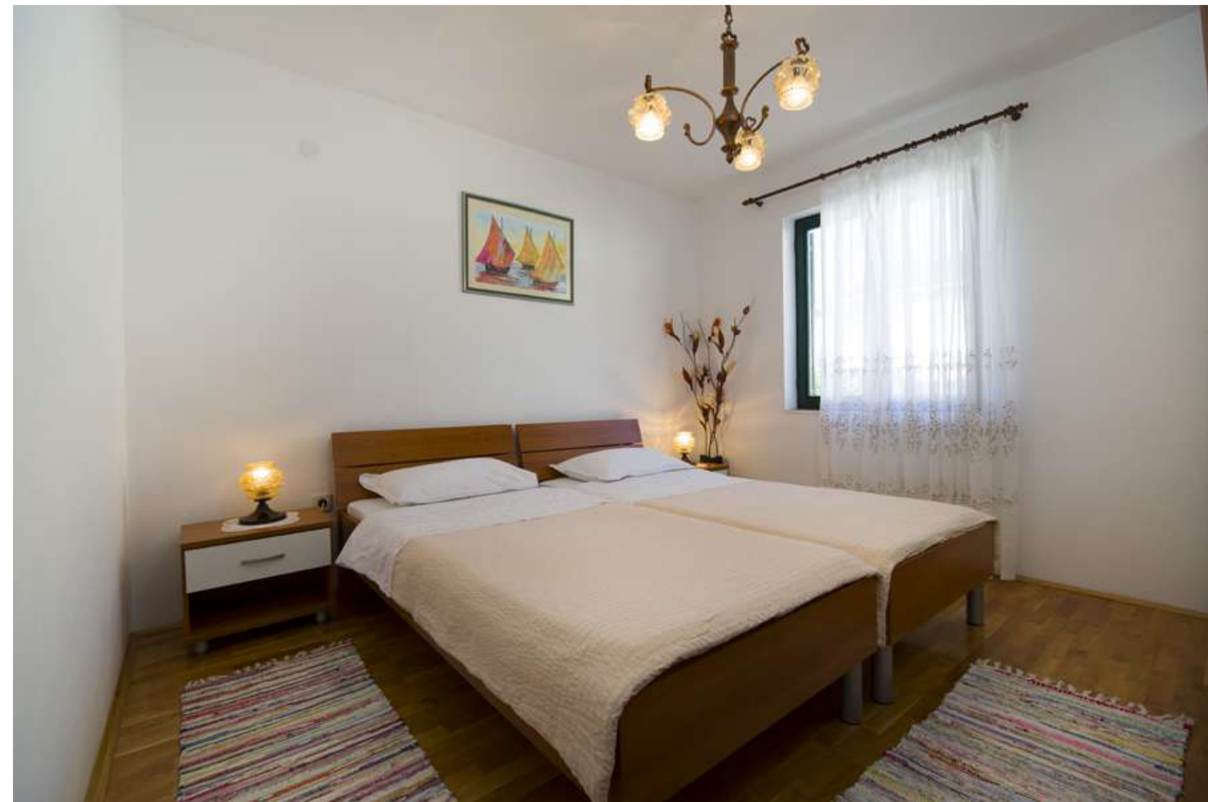
Third bedroom with two single beds that can also be turned in one double bed