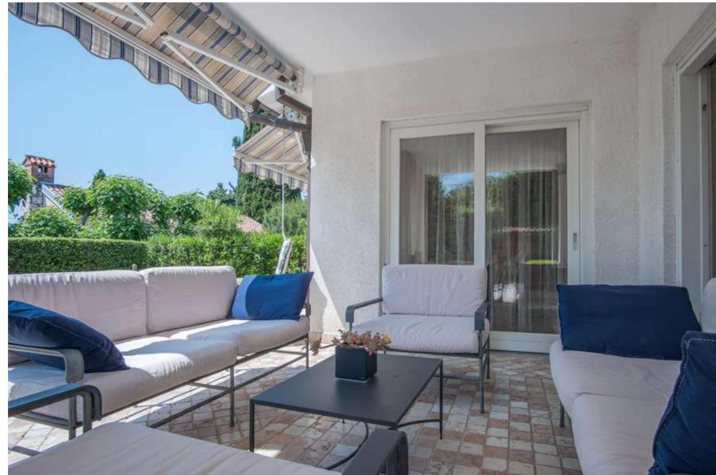
Covered outdoor terrace with garden furniture