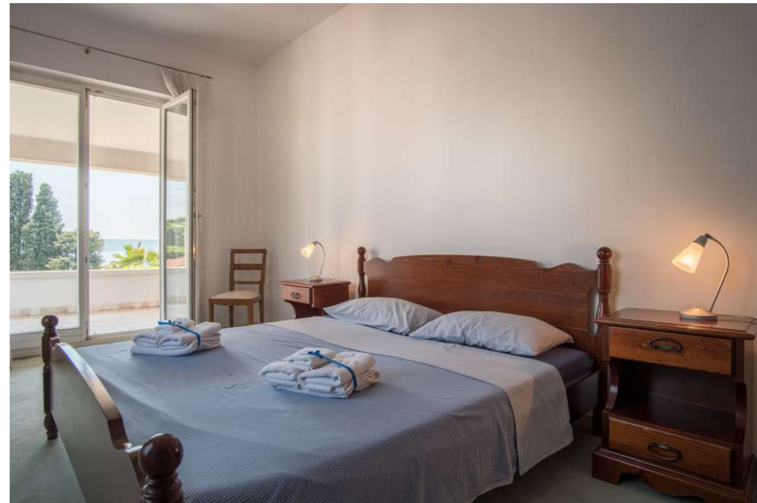
Second bedroom with double bed and romantic details