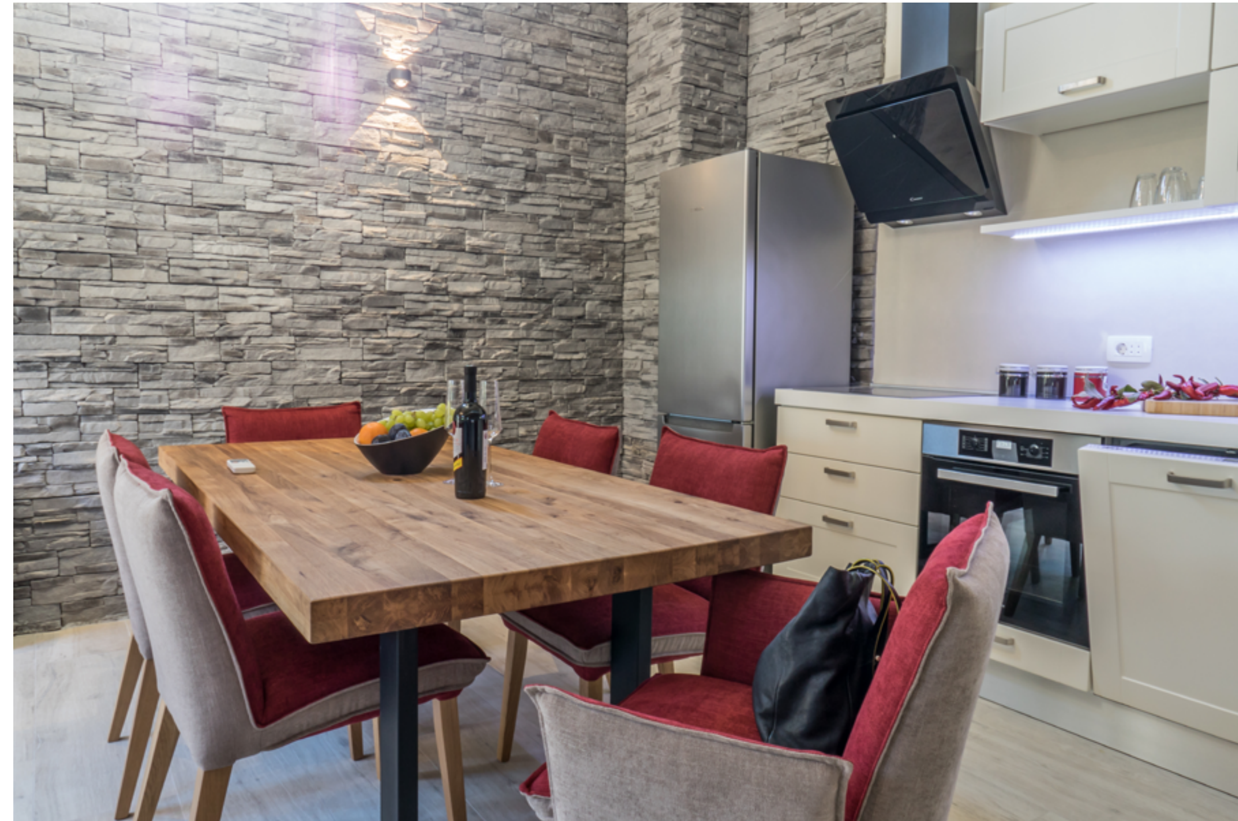
The modern kitchen is fully equipped with all necessary utensils

It also features a coffee machine for morning delights!