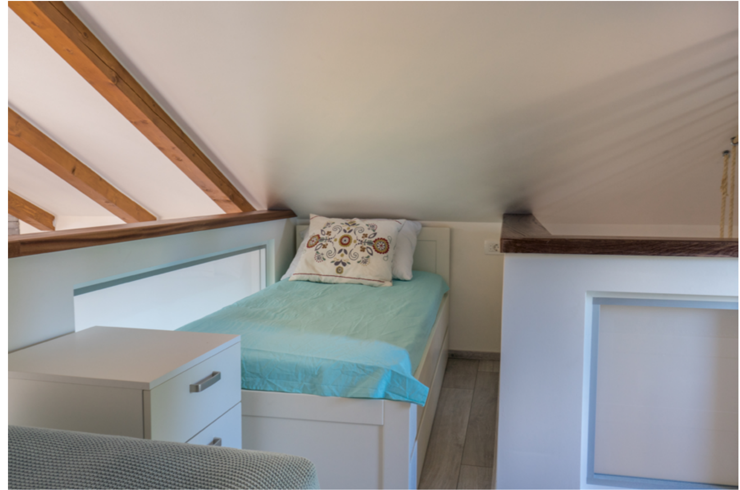
All beds are equipped with very quality mattresses