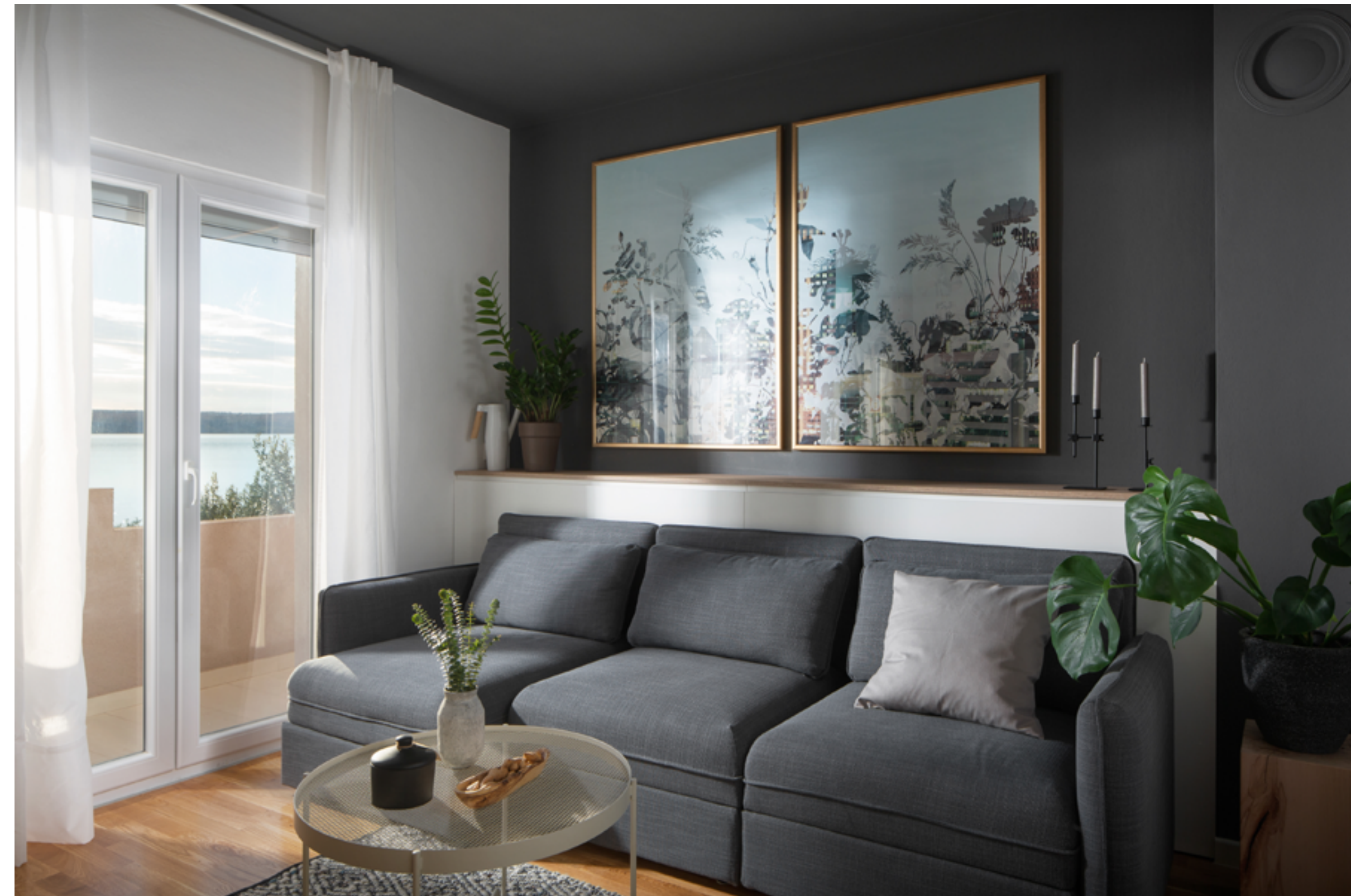
This charming living room features a pull-out couch, which turns into a cozy bed for one child