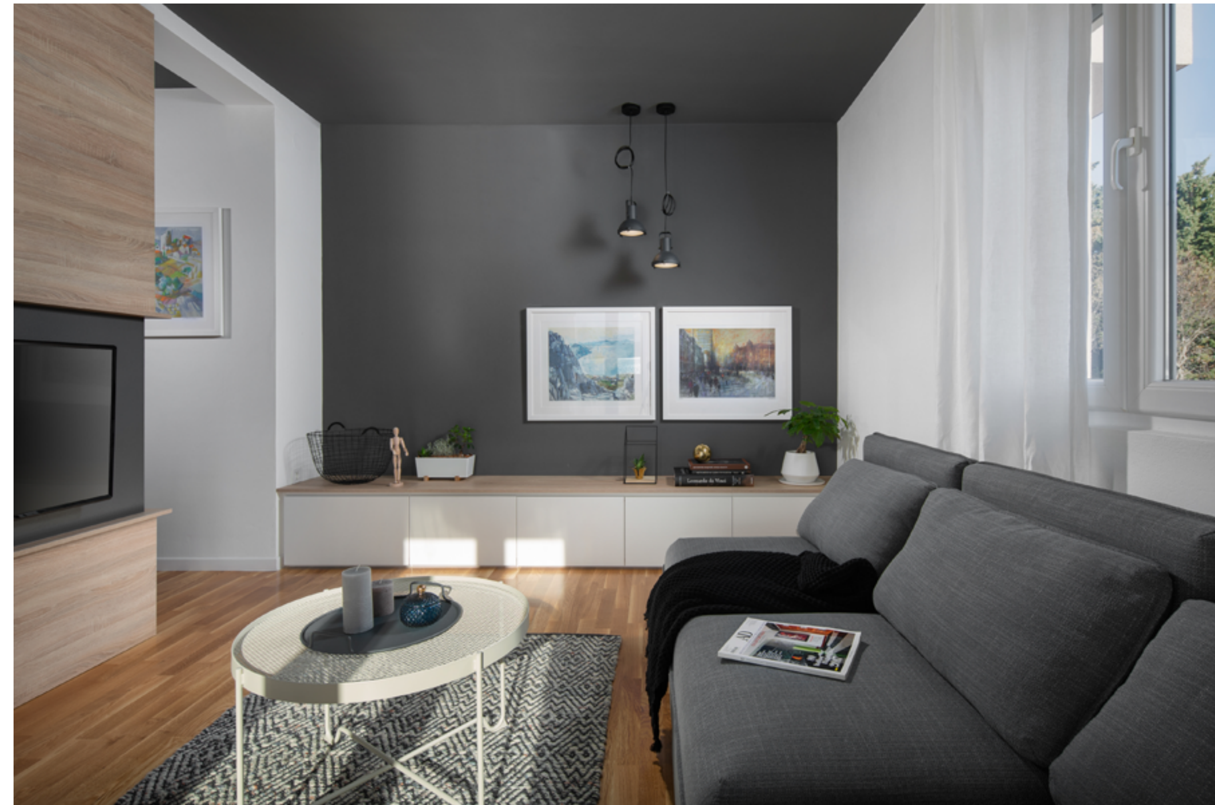
This charming living room features a pull-out couch, which turns into a cozy bed for one child