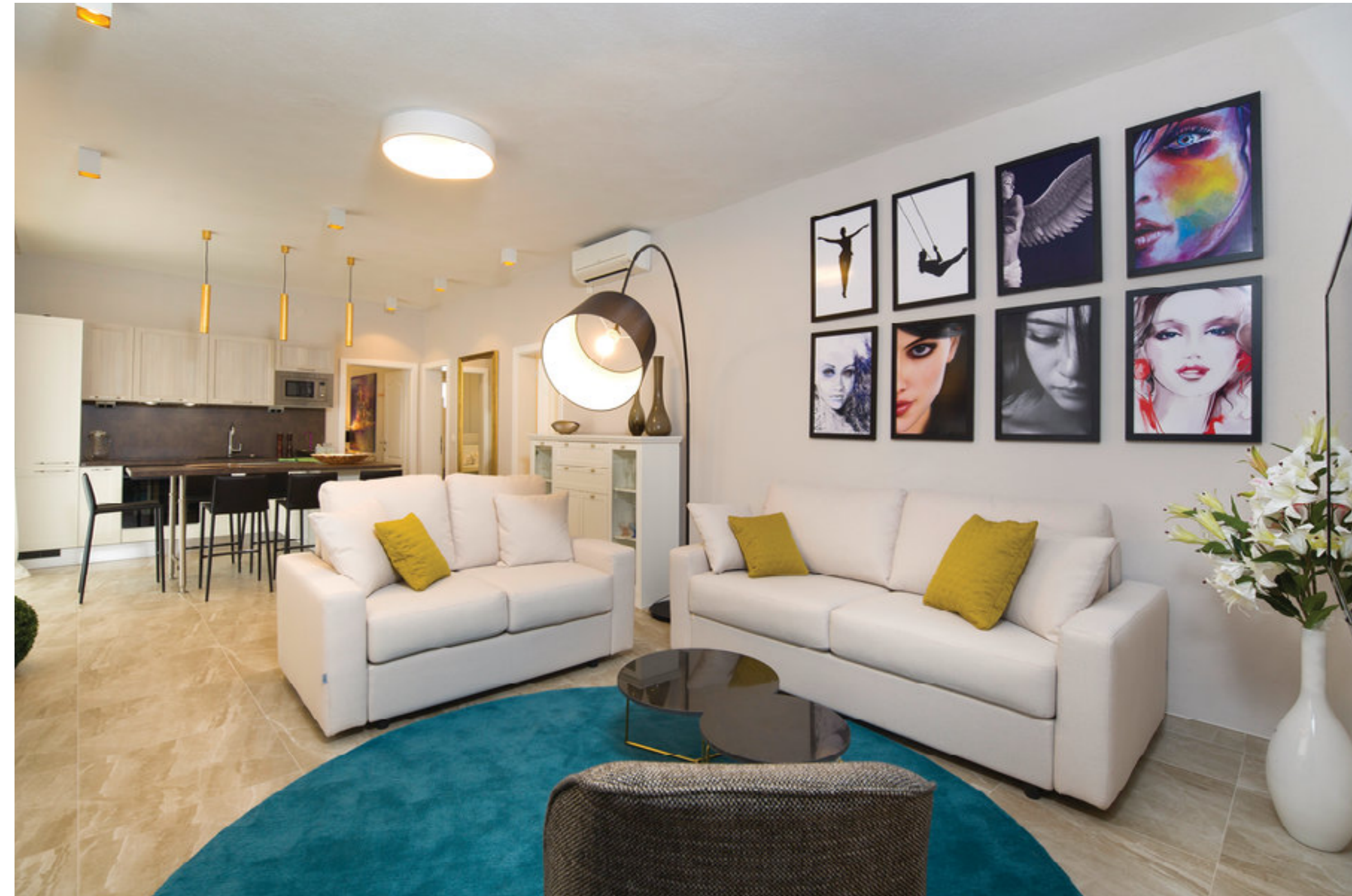
This is the perfect spot for relaxing after a day on the beach ;)