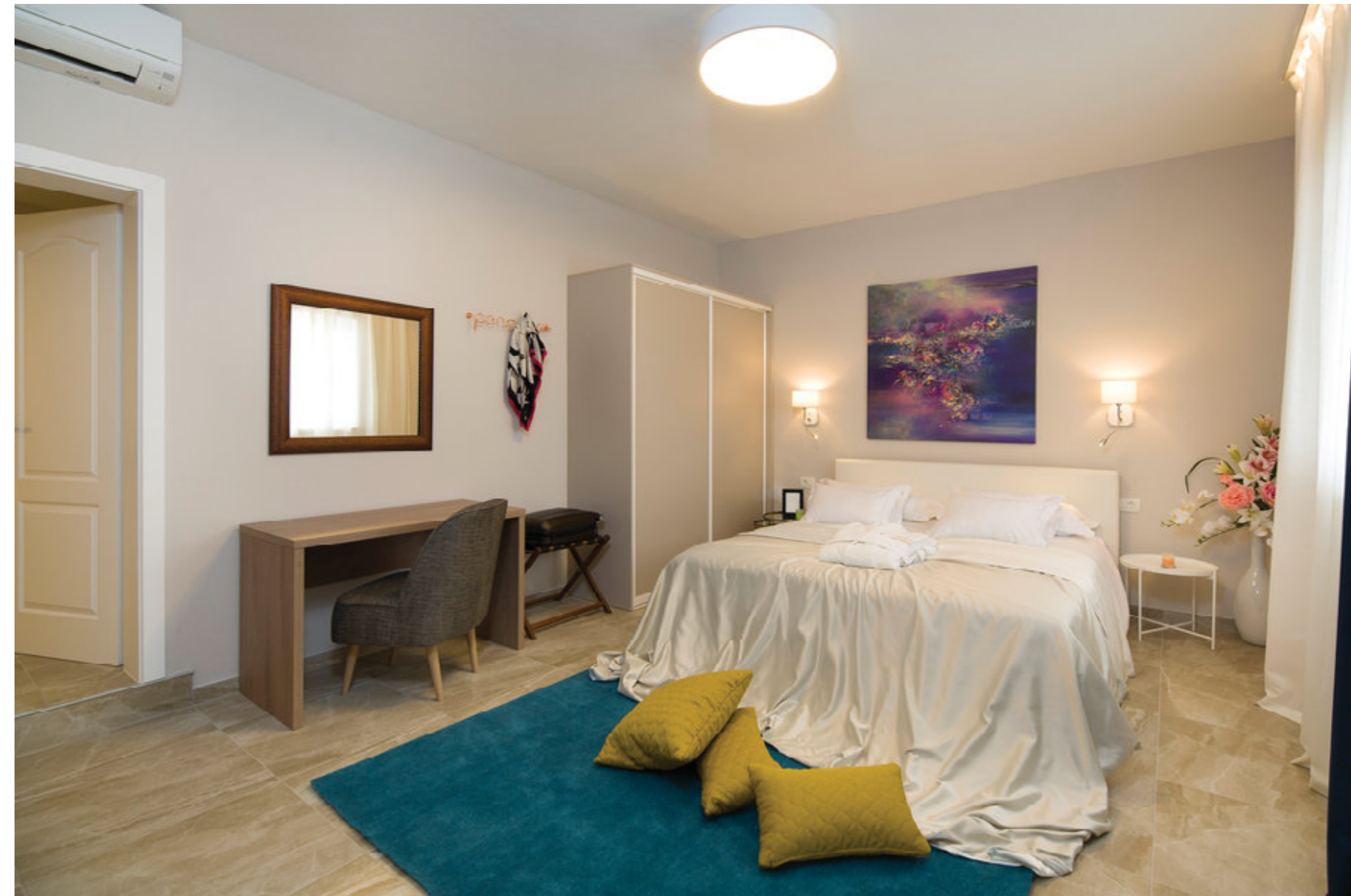
Second bedroom with romantic details