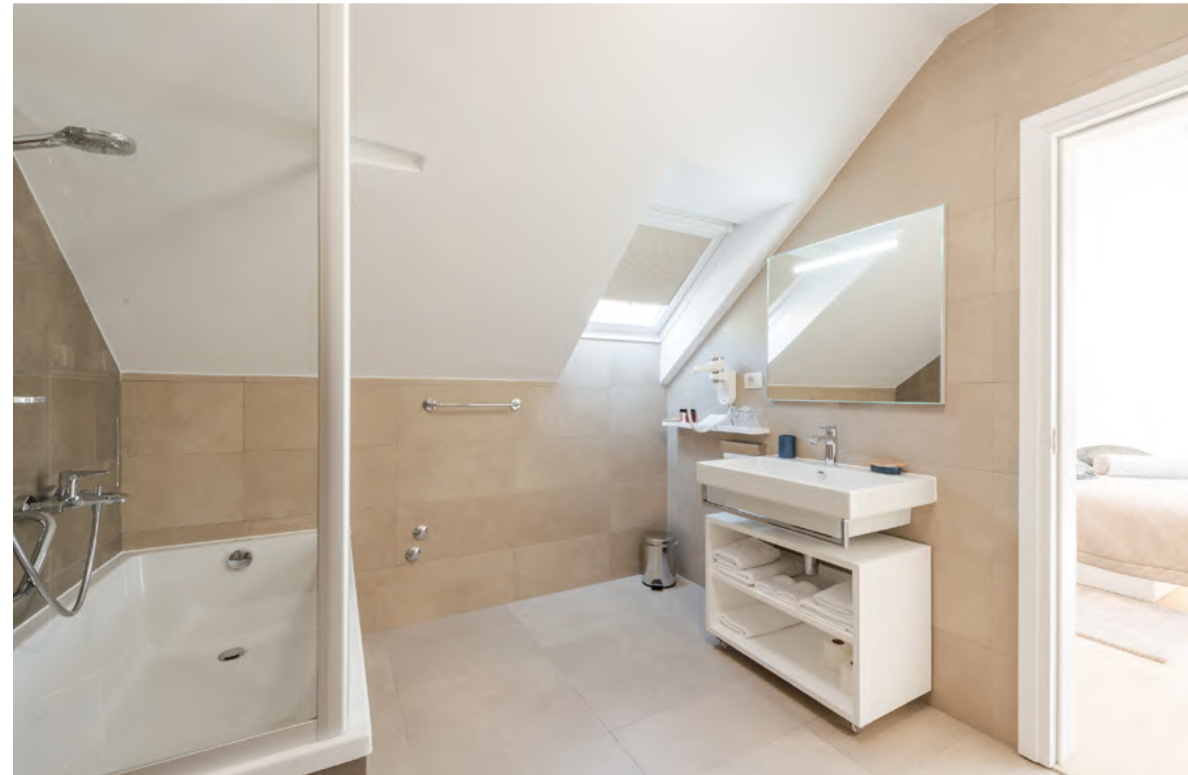
This is the perfect place for pampering